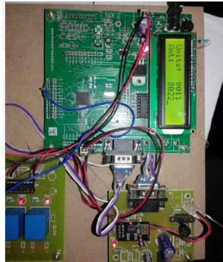
Fig.3.2. Amount and units indication.

Smart meters are electronic measurement devices used by utilities to communicate information for billing customers, track and record customers' electric use and operating their electric systems. With smart meters, sending data to the electricity supplier automatically, there would not be the need to have the meter mounted outside the customer premises. Placing the meters inside a garage or other room would provide a much more protected location and aid in the security of the smart grid. This would require moving or extending the power line terminus from their normal location to the interior which would add considerable expense, and most likely be prohibitive for any extensive smart grid projects. As a matter of fact, for any new homes built in areas with existing smart meters infrastructure, this may be a useful option. Data can be sent wirelessly to an access point at the power pole or via communication over the low voltage power lines.