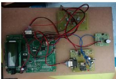
Fig.3.1. Working model.

Traditional application development has always followed a monolithic approach of dividing functionalities into methods and classes but inside the same single unit which is deployed as a process. Such an architecture allows for proper testing of the application as well as usage of the deployment pipeline. However, this approach shows severe limitations when considering scaling of systems to multiple users and rapid deployment cycles. Each and every change requires the entire application to be re-deployed. Furthermore, while scaling up, the entire application is duplicated onto servers instead of just scaling the functions which are facing a higher load. For this reason, companies like Netflix and Spotify popularized the use of a new style of software development based on micro services. Micro services are a way of breaking down large applications. Instead of in-memory function calls, each service runs as a separate process. Microservices are structured in a way that they are small, highly decoupled and task specific. They use lightweight mechanisms to communicate with each other. Recent popularity of the Internet of Things (IoT) has shown another domain wherein this approach could make design of applications easier as well as more robust in dealing with large number of connected devices. This paper looks into the reasons for using microservices in IoT as well as existing frameworks which help developers use this approach.