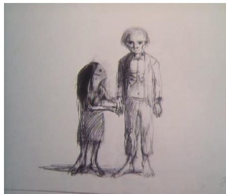
Fig. 3 "Horror-camp"