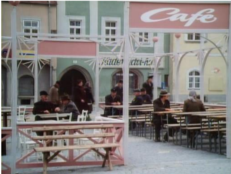
Fig. 1 Square in Theresienstadt

Everyone had to participate in the deceit, including artists, who showed Karl the pictures they painted of children smiling and playing in the camp. These pictures were supposed to serve as a confirmation of the Nazi story of “good living conditions in Terezin”. After Karl protested against such scenes, the artists show him works where they presented the real life in the camp. These images were called the “horror-camp” (Figures 2 and 3).