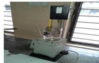
Fig.4.2. Ring and ball apparatus.

The pianissimo degree of the blacktop is the condition at whatever the blacktop attains one grade of pianissimo low described test setting. The lenitive case of blacktop indicates condition sensitivity of blacktop. As we know, blacktop impending used incursion structure need have low condition awareness. Higher lenitive moment indicates devalue climate susceptibility. Hence, it is responsible for to know the lenitive degree of blacktop to counterbalance evaluate the fitness of blacktop raid planning.