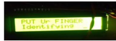
Fig.4.1. Identification part.

levels of industrialization systems. Industrial computerization systems exploit cellular verbal exchange to hook up far away and native facilities and gear to extend ready efficiency.