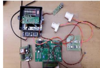
Fig.4.1. Hardware kit.

In this challenge, we are using the electricity meter to a degree the electricity fed on through the electric loads in the concern/ domestic. The water level sensor is used to measure the moisture stage of the plants and turn on the water pump every time needs. The IR sensor is used to feel the stranger entered the residence. All the one's sensor values will display on the LCD display screen continuously.