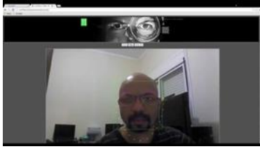
Fig.4.1. Face recognition.