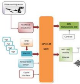
Fig.1.1. Block diagram.