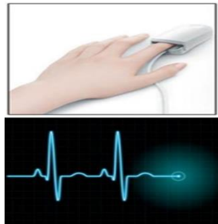
Fig.3.1. Pulse Counting Machine.

Heart rate is the boost of society's order, handle earnestness and aspiration index of cardiac operation. But most society is very tough to exactly assess H-hour and his soul rate integrity. If the spirit rate survey with me, focus ECG electrodes will be detected by keeping an eye on the cue processing design, the user can on any occasion that your mind rate changes, changes in soul rate, self-keep an eye on quality. Heart rate keeps an eye on for focus rate area (60 ~ 160) / min. Circuit by adjusting the proper components, in the (60 ~ 160) / min not over the sounding caution can change the soul rate cover. This spirit rate covers the diameter of the invent station ethics ± 20% differ. If essential beliefs equally intensity on the 100 / especially, the focus rate beacon area (80 ~ 120) / min, if the soul rate exceeds this cover, the devalue specify, the mechanism does not accurate if the soul rate in the area of the mechanism ECG is the proper issue.