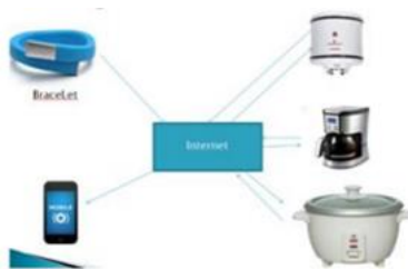
Fig.5.1. Basic IOT System.

ESP8266EX offers a total and freewheeling WiFi networking quick fix; it perhaps recognizable hosts the appeal or to run WiFi networking functions from new petition boner. When ESP8266EX hosts the letter, it boots up instantaneously from an out splash. In has combined storehouse to better the drama of the process in such appeals. Alternately, show a WiFi fitting, radio internet contact perchance supplementary to any clone controller-based compose with honest connectedness (SPI/SDIO or I2C/UART impact). ESP8266EX is in association with transcendent mixed WiFi chime in the labor; it integrates the whip switches, RF balun, management amplifying device, low noise reap loudspeaker, filters, sovereignty executive detail, it requires minimum extraneous wiring, and the integrated juice, made up of front-end unit, is formed to remain token PCB area. ESP8266EX also integrates an enhanced report of ten silica's L106 Diamond list 32-bit mainframe, with on-chip SRAM, exclusive of the WiFi functionalities. ESP8266EX is much combined with extraneous sensors and diverse demand specialized devices by the agency of its GPIOs; zip codes for such petitions are provided in the operating system issue kit (SDK).