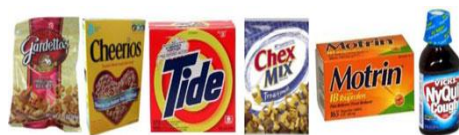
Fig.1.1. Examples of printed text from hand-held objects with multiple colors, complex backgrounds, or nonflat surfaces.

In worldwide there square measure 314 million visually impaired people and blind, out of that forty-five million square measure visual impairment that was discharged by “World Health Organization” in ten facts concerning cecity. The valuation of The National Health Interview Survey twenty-five.2 million adult Americans square measure blind or visually impaired. The valuation of The National Census of Asian country their square measure 21.9 Million disabled folks within the country, out of that more than fifteen million folks square measure blind[1][2]. Reading is clearly necessary for today’s society. Printed text seems all over within the variety of receipts, bank statements, reports, edifice menus, room notes, product labels, directions on drugs bottles, etc. Optical aids, screen readers, and video magnifiers will help blind users and people with low vision to access documents, there square measure few devices which give sensible access to common hand-held objects like productlabels, and objects written with text like prescription medication bottles. the power of individuals World Health Organization are blind or people who have important visual impairments to browse written labels and products packages will enhance their freelance living and foster economic and physical independence so here we tend to square measure aiming to propose a system that it helps to blind folks.