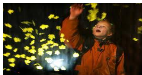
Figure 2D projection screen

It is one type of advanced projecting device which consumes water and electricity to form fogs on which images are projected.