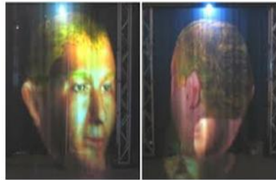
Figure dual projection

3D visualization." Images can be projected on both sides of the screen creating a 3D virtual effect.