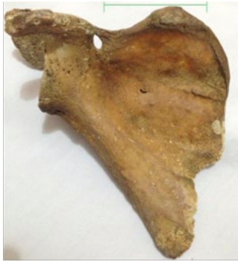
Figure 2 – Overview of the scapula with suprascapular foramen. Green line: distance between foramen and superior angle of the scapula.