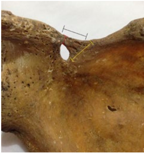
Figure 1 – Morphology of ossified superior transverse scapular ligament. Black line: ligament length; red line: ligament width; yellow line: line of fusion between the ligament and the scapula on the medial site.