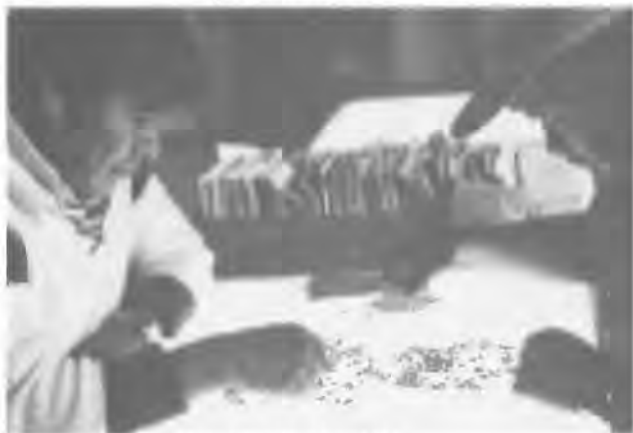
Maize selection at CIMMYT.

Perhaps the most neglected of all the world's cereal crops until the establishment of the IARCs were the small grains, sorghum and the millets. These are the most important food crops of the semi-arid tropics, staples for perhaps 500 million people; yet sorghum yields in the developing countries average only about 20% of those obtained in North America where the