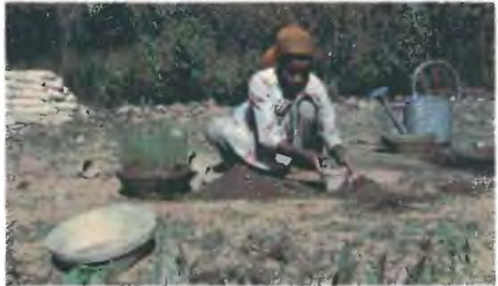
The desert claims 6 million hectares annually, but efforts are under way to stem its advance.

Despite this apparently gloomy picture, there is hope for the future supply of food. Optimistic experts predict that we have yet to come close to achieving maximum production from present agricultural lands — let alone lands that have yet to be cultivated. The key to their optimism is technology. It was technology that enabled the world's farmers to increase production by 26% during the 1970s (for the developing countries, the increase was actually 33%). Agricultural science produced new