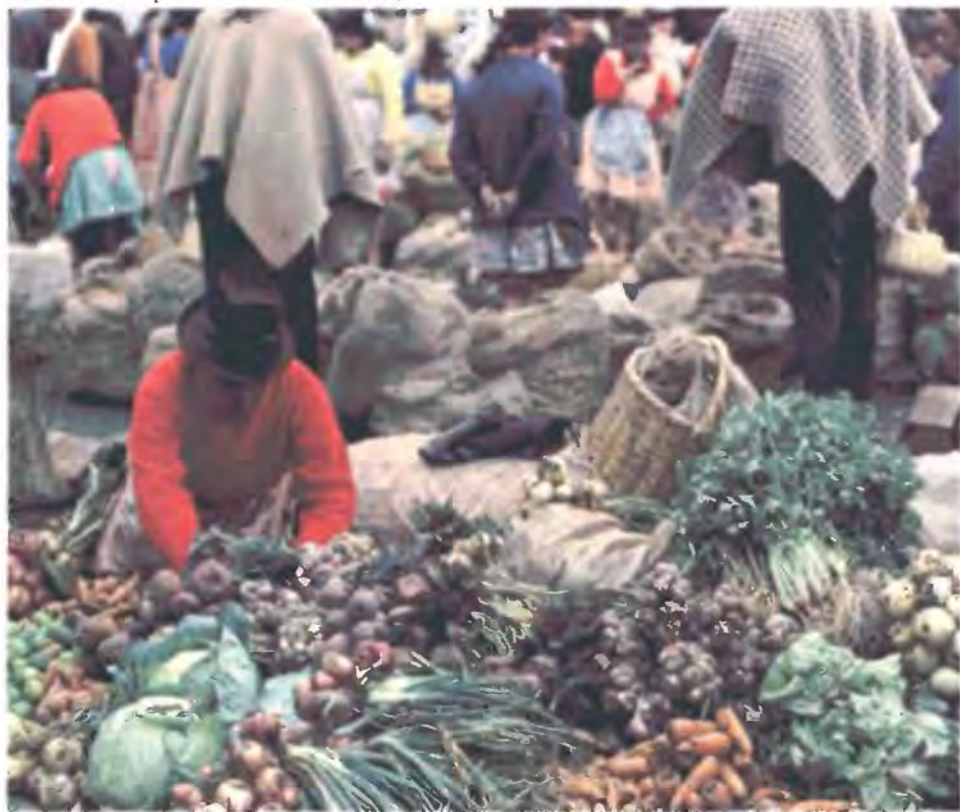
People with a little extra money spend it on food.

Agricultural land Will the exporting countries be able to meet the demand? In the past, the expansion of agriculture meant simply the cultivation of more land. No longer. The best agricultural land is now under the plow, and, although there are still large regions with good agricultural potential — such as the Indus Delta, the Sudan, and the Gangetic plain — they require enormous investments of both capital and political will to realize their full potential. Meanwhile, we continue to lose arable