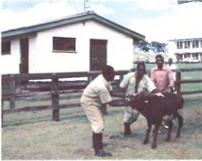
Kenya's animal-production researchers work in close collaboration with ILRAD.

IARCs. The cooperation strengthens the web of agricultural research, interweaving national, regional, and international programs and providing grounds for a reasonably optimistic view of the future for food. Unfortunately, there are also grounds for grave concern — the web is still fragile; the future of the IARCs is by no means clear.