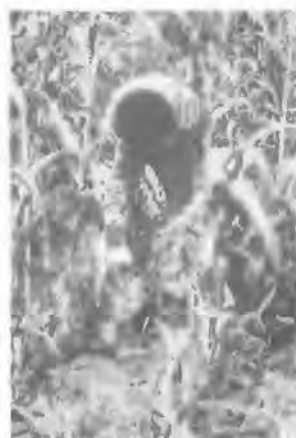
Intercropping systems: meeting specific agroclimatic conditions.