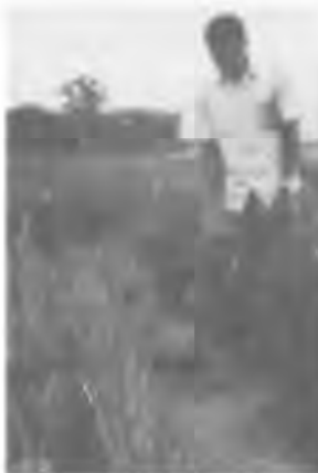
IITA also has a rice program; its high-yielding varieties have been adopted by the government of Nigeria for its self-sufficiency program.

tion of all the IARCs. Thousands of scientific personnel at all levels have been trained at the centres, strengthening the national research programs of the developing countries immeasurably. For example, since WARDA was established in 1973, it has provided training for more than 600 scientists and technicians. These are the people who form the research networks that should eventually enable the region to achieve its goal of self-sufficiency in rice.