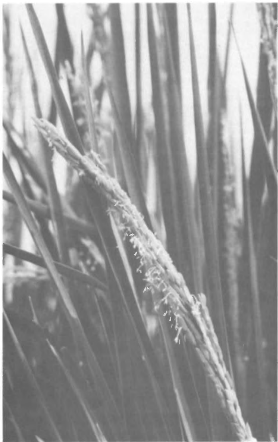
A high-yielding variety of rice in flower at IRRI.