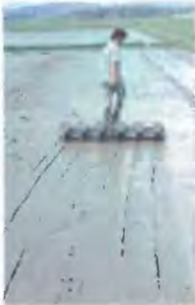
Technology has planted seeds of optimism.

land to urbanization, industrialization, soil degradation, and desertification. The spread of the desert alone claims 6 million hectares each year, and highly intensive agriculture can be so destructive of the soil that food exports are being termed topsoil exports. The aggregate amount of land under cultivation is expected to increase by only 4% in the next two decades, whereas production must increase by 60%.