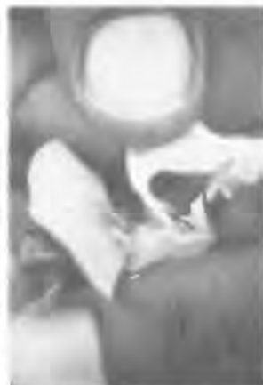
Cross-breeding cowpeas at IITA: the Institute has developed almost 100 disease-resistant lines.

The possibility of drought is always a concern of farmers in the semi-arid regions, and ICRISAT researchers are experimenting with various cereal-legume combinations to obtain maximum benefit from the limited rainfall in the region. Promising results have been obtained from pearl millet and