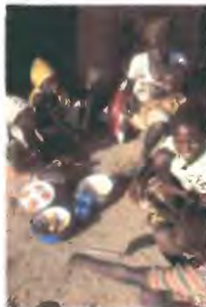
Ensuring everyone gets a share: IFPRI’s mandate.

one, then IFPRI’s role is to suggest policies to ensure that everyone gets a share of that food. This is an oversimplification, for the interactions between food supply and demand are extraordinarily complex, but it does illustrate why the network needs an institution to study and develop food policy. IFPRI studies the relationships between food production, consumption, and trade and how they are influenced by national and international policies. In short, it is concerned not just with how a new technique affects the production of a particular crop but also how the change impacts on the market and why.