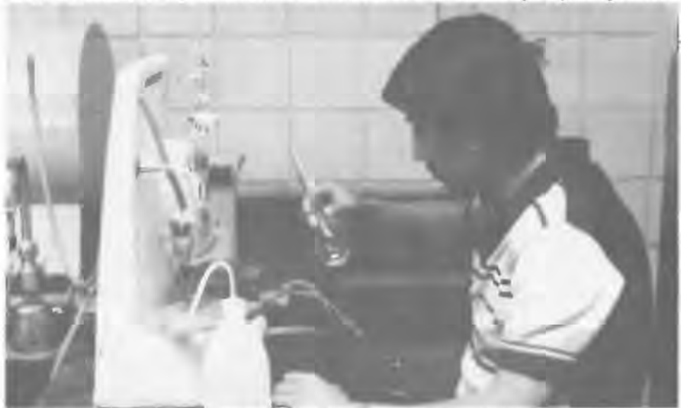
Strengthening research capacity at the national level — the link between international and local programs — is the aim of the International Service for National Agricultural Research.

Finally, there are three centres that are not active in agricultural research at all but are concerned with vital related issues such as economic and trade policy, the preserva-