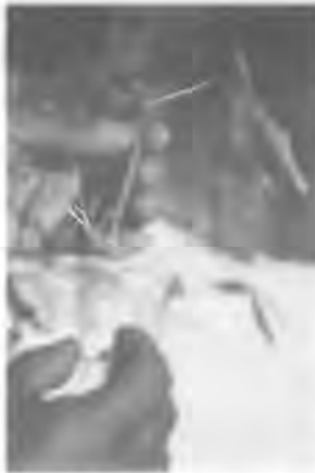
Cassava is vegetatively propagated — part of the extensive selection program at CIAT.

Yams, cocoyams, and sweet potatoes are the other root crops for which IITA has major responsibility: low yields and poor storage quality are the major problems the researchers are working to overcome. Their efforts are producing impressive results — some IITA lines of sweet potatoes grown without the use of fertilizer have produced yields almost four times those of traditional varieties. Many of the IITA lines are also resistant to viruses and insects that in the past were largely responsible for