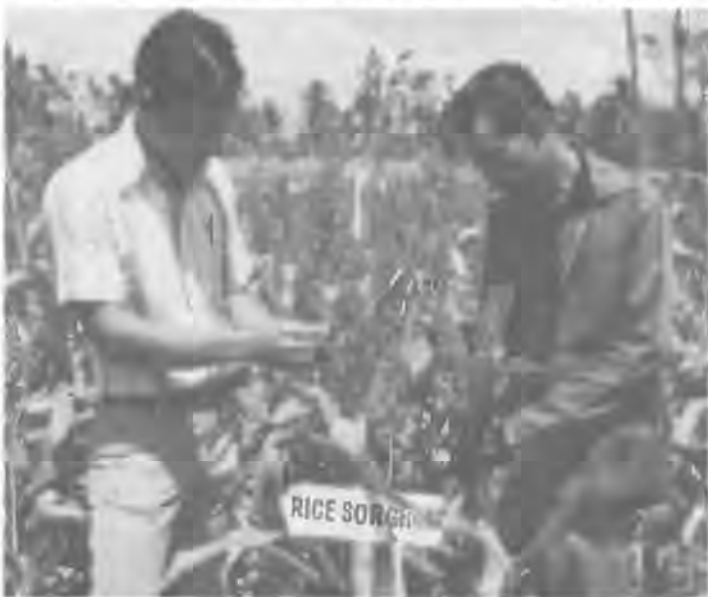
Sorghum after rice at IRRJ: a promising combination for small farmers.

Livestock The complete farming system includes not only crops, but a variety of livestock — poultry, pigs, goats, sheep, and cattle. It has been argued that animal production should not be encouraged because it is very often inefficient: to produce a kilo of grain-fed beef may take as much as seven times that amount of grain, and range cattle occupy huge areas of land, some of which might be producing food crops. There are more efficient ways of producing animal protein than by feeding grain to cattle, however, and grazing animals can make use of marginal land that serves no other agricultural purpose. Ani-