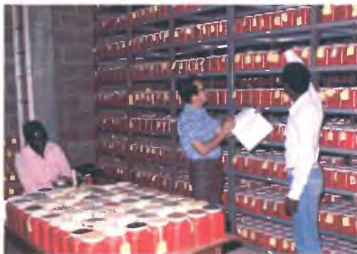
ITTA's germ-plasm collection: more than 20,000 specimens of cowpeas, maize, yams, sweet potatoes, and other crops.

The close relation between the IARCs and their national counterparts has, therefore, been a key to success. By the same token, lack of strong, capable national programs in some de-