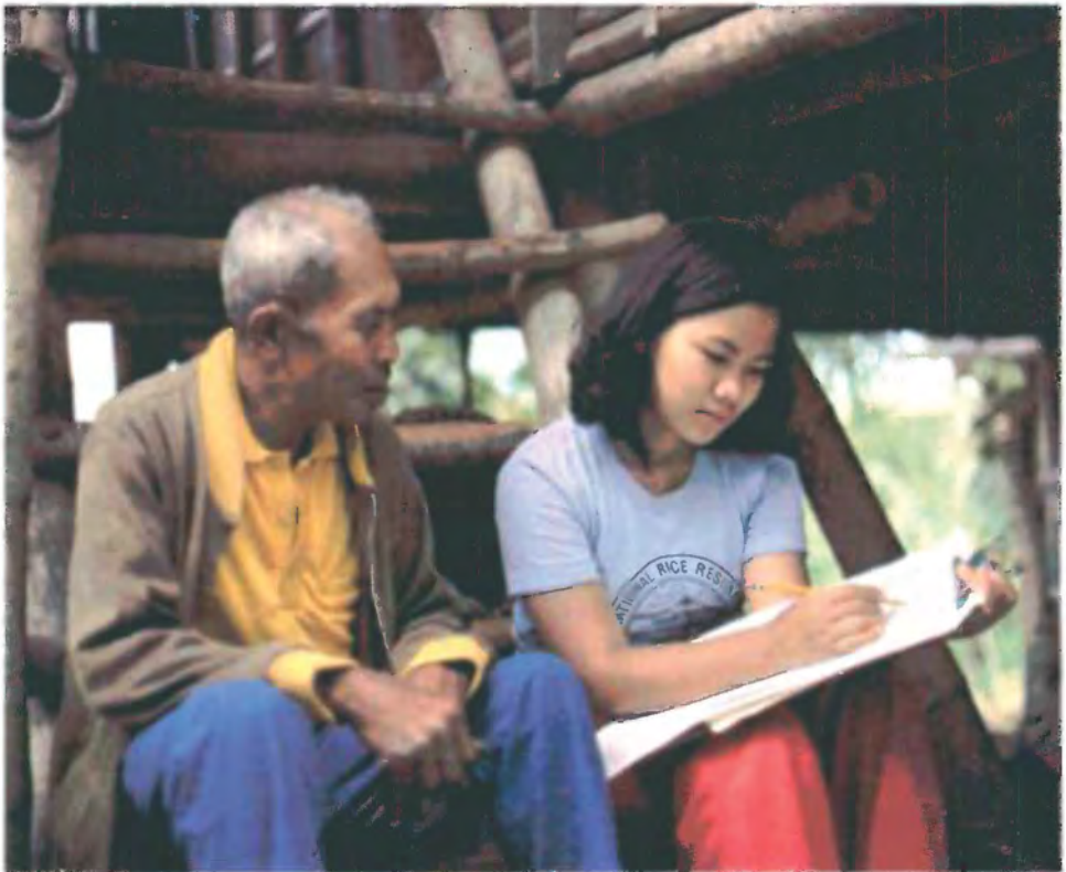
Research results must be understood before they can be implemented by farmers.