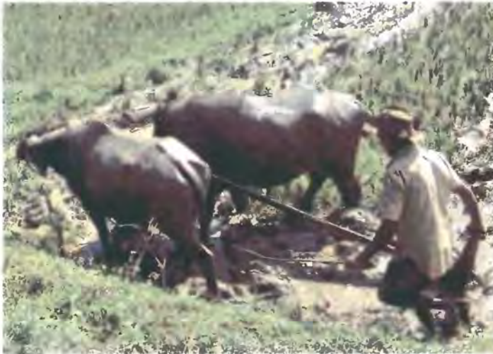
Cultivation: socialization and a step beyond survival of the fittest.

the forests and learned to cultivate the plains. This development allowed humanity to multiply beyond the “natural” limit and led inevitably to Homo sapiens ’ becoming the dominant species on earth.