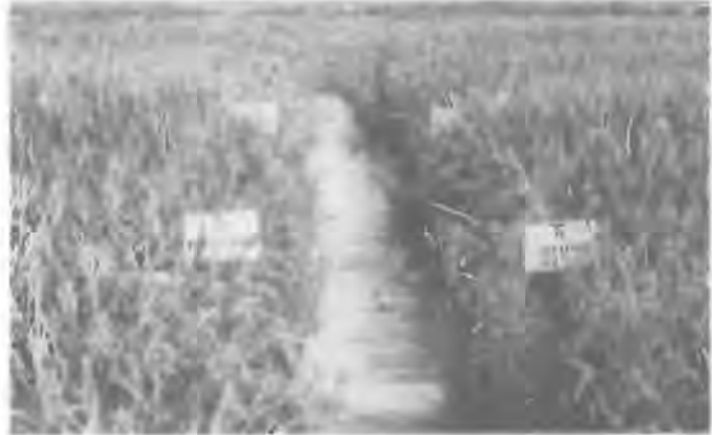
WARDA trials: improved rice varieties for the region.

In fact, training local staff is an essential part of the opera-