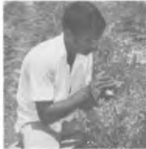
Pigeon peas in breeding experiments at ICRISAT.

potential as a protein producer in the tropics. IITA researchers are working to improve the plant's nitrogen-fixing ability without inoculation in African soils, one of the main characteristics that need improvement. Already, experimental crops at the Institute have yielded better than 3000 kg/ha, promising to outyield the traditional cowpea if such results can be reproduced under farm conditions.