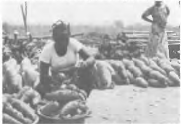
Cocoyams in Cameroon: research on root crops is a priority for IITA.

holding down production. Another important step toward increased production has been the recent development of techniques for growing yams from seed rather than from tubers, which opens up entirely new prospects for breeding and selection.