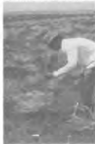
Research at ICARDA and ICRISAT has resulted in a doubling of chick-pea yields.

A relative newcomer to Africa, the soybean is not yet entirely at home there, although it is believed to have great