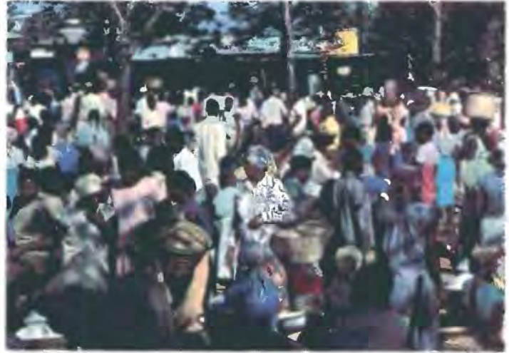
The population "bomb" exploded generations ago.

falling below the 2% level for the first time. It is now thought to be 1.7%. Even at this rate, the world's population is projected to reach 6.1 billion by the end of the century — that is, one thousand five hundred million more people to be fed in the next 18 years. Just to keep pace with the present, inadequate level of food supply would require an additional 30 million tonnes of grain alone each year. And we are not keeping pace. In 1981, more than 100 countries consumed more food than they produced. African countries actually consumed 10% less food than a decade earlier. By the year 2000, the world's farmers will need