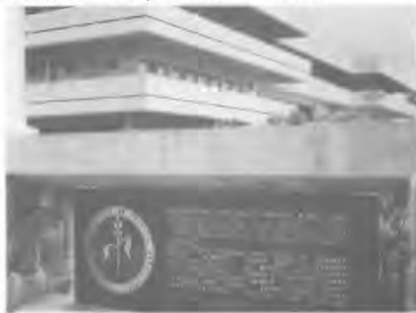
IITA focuses on improvements for its agroclimatic zone.

required to support all the centres, however, and they channel funds to those that fit within their own priorities. In fact, only one donor supports all 13 of the centres that make up the network as it exists today. The Consultative Group also includes elected representation from all regions of the developing world.