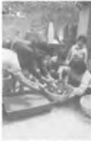
Washing and cooking potatoes in Peru: CIP has developed appropriate techniques for processing and storage.

anced diet. In the Middle East, legumes are known as “poor man’s meat,” and, precisely because they are the food of the poor, rather than a cash crop, many food legumes were generally neglected by agricultural science until the advent of the IARCs.