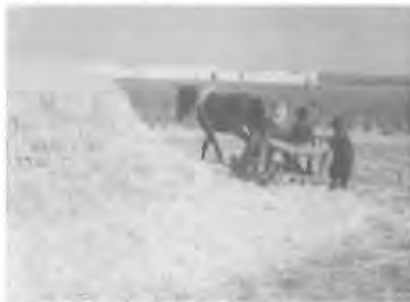
Stable yields under drought conditions offer the security subsistence farmers need.

grain is grown for cattle feed. Research conducted by ICRISAT in Asia, Africa, and Latin America is rapidly helping to correct this imbalance, however, as varieties with better resistance to diseases, pests, and drought are developed and adapted to local conditions.