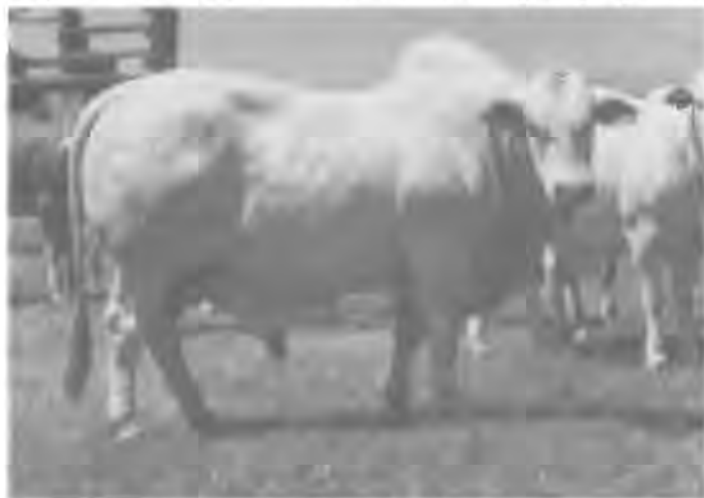
Cattle in Africa: trypanosomiasis and theileriosis are the major threats.

Much of the success of the IARCs has been based on genetic improvement of crops — achieved through the collection and careful storage of thousands of varieties of each species — and the painstaking selection of plants that have the required characteristics: disease resistance, drought tolerance, high yield, long or short stalks, abundant or limited foliage, rapid growth,