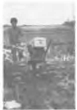
Every step in rice production is being studied

The long-term goal of WARDA is to close the gap between production and consumption of rice in the region. The 15 member countries of the Association, which receives about one-third of its funding through the CG, annually consume about 3.5 million tonnes of rice. The region produces only a little more than 2 million tonnes, and consumption is growing faster than production.