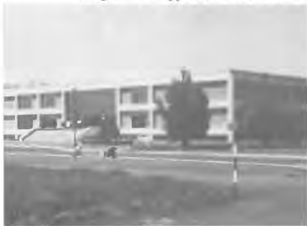
CIMMYT's headquarters are in El Batán, Mexico.

The Consultative Group was conceived of as "nonorganizational." The only requirement for membership as a donor is the willingness to provide regular, substantial grants to support the international agricultural research system. Donors are not