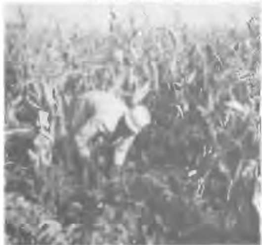
Planting a nitrogen-fixing crop, such as cowpeas, with a nitrogen-demanding crop like maize substantially reduces fertilizer needs.

Legumes Among the most important crops for people in developing countries are those of the legume family — peas and beans of many types. They are especially important in mixed cropping systems because of their ability to transfer nitrogen from the air to the plant. In effect, they provide their own fertilizer, the excess being available to associated crops or those that follow in a rotation. Rich in protein, food legumes are an essential part of the diet of 700 million people and complement cereal grains. Maize and beans, wheat and chick-peas, rice and soybeans are all traditional combinations that provide a bal-