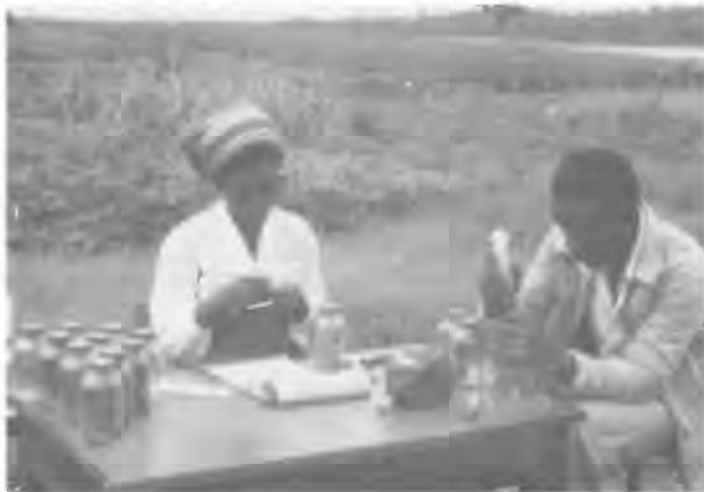
Nitrogen-fixation analysis at IITA.

In Africa, IITA researchers have found that cassava and maize grow well together. The fast-growing maize is not constrained seriously by the slower-paced cassava and helps to limit weed growth. After the main harvest, the canopy growth of the cassava plant helps protect the soil surface from rainfall erosion.