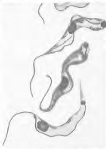
Trypanosomes undergo remarkable transformations that elude their hosts' ability to combat them.

establishment of a network of pasture-legumes research projects in countries throughout the Andean region.