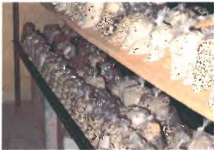
Safeguarding germ-plasm resources is IBPGR’s raison-d’être .

If the ultimate goal of the commodity-oriented IARCs is to enable the world’s farmers to produce enough food for every-