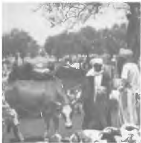
Much land that cannot sustain food crops is suitable pasture for livestock.

In tropical Latin America, there are also vast areas of savanna land that will not support productive agriculture because the soils are too acid and infertile — perhaps 50% of the region's land falls into this category. Scientists at CIAT are working to develop these lands into rich pastures that not only could increase production of milk and meat but could release for crop production other more fertile land that is currently used for grazing. The key to this ambitious scheme is the selection of forage legumes and grasses that can survive on the soils and the