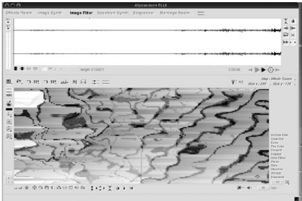
Filter techniques in Metasynth used for the Poseidon divinity sound in In the Temple

Of course there is a lot intuition and meditation behind the compositional process of both works: for example the fifth movement of In the Temple is a musical portrait of the Labyrinth. In this hall you see the paintings of 29 divinities taken from different religions of the world, from Aphrodite through to Amaterasu. Such divinities are proposed as containers of specific energies. I meditated a lot on the primordial essence