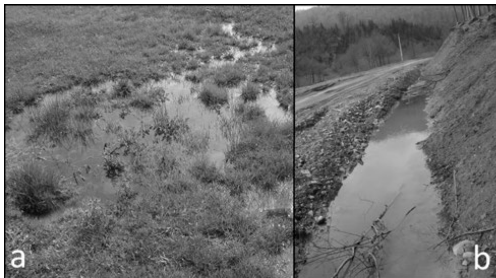
Fig. 1. Habitat overview of breeding ponds of Lissotriton hybrids in the Eastern Carpathian Mountains; in the left photo (a) is a fresh snow-melt temporary pond, in the right photo (b) is a roadside ditch with water used by hybrids for reproduction.