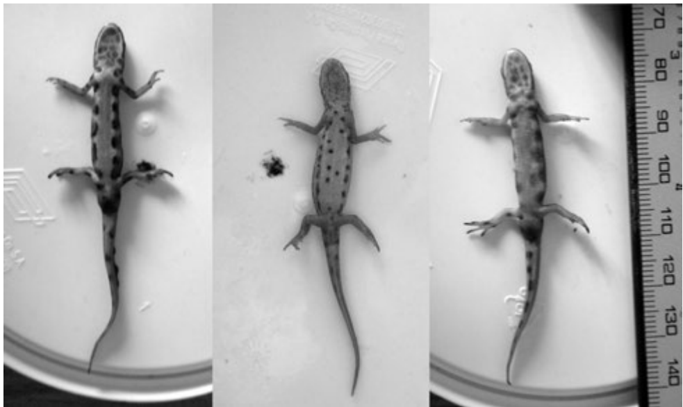
Fig. 3. Some individuals of L. montandoni x L. vulgaris founded in Negrițești, Neamț County.

Mountains). The characteristics of the breeding ponds where we observed L. vulgaris x L. montandoni hybrids are similar to those found by Fuhn et al. (1976), Iftime (2004) and Gherghel et al. (2008) and can be described as temporary and permanent ponds formed by rainwater or snow-melt (Fig. 1a) or by overflowing mountain rivers. Other important habitats used by newts for reproduction are roadside puddles or roadside ditches (Fig. 1b). As observed by Iftime (2004), hybrids are generally present mostly in human disturbed areas, where the anthropogenic impact (like deforestation, heavy road traffic, near localities) is greater than inside forests.