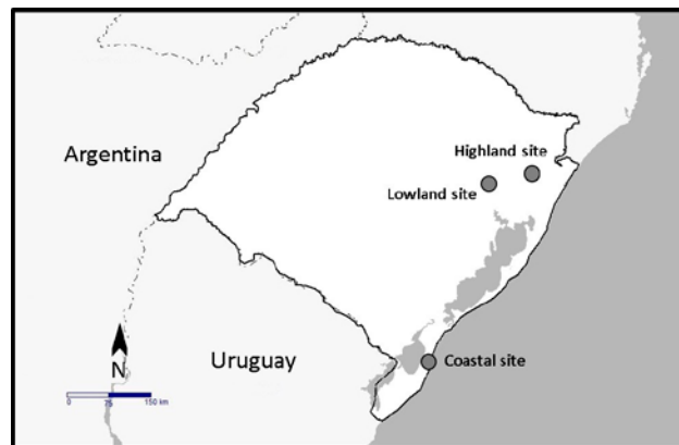
Fig. 2. Geographic location of the sampling sites.

The artificial models remained exposed in the field for 48 hours. During this time, they were inspected twice, after 24 and 48 hours since the installation. During the inspections, we recorded the presence of attack marks on the models. Each artificial model that clearly showed marks of bird attack (e.g., peck-