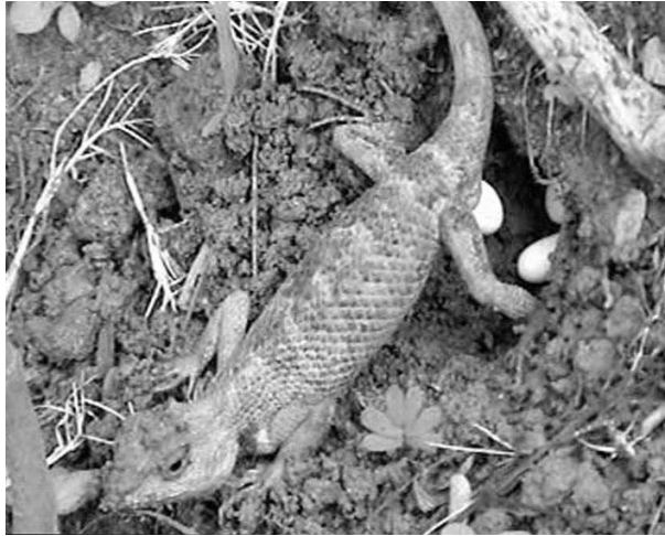
Fig. 1. Calotes versicolor laying eggs in captivity.

Among the captive born lizards that survived for a year or more, 6 of them (L 1 to L 5 and L 8 ) bred in the 1 st year between the age of 7-8 months (first breeding season after their hatching), 1 lizard (L 6 ) skipped breeding in the 1 st year and bred in the 2 nd year at an age of 21 months and another lizard (L 7 ) skipped breeding in the first two years and