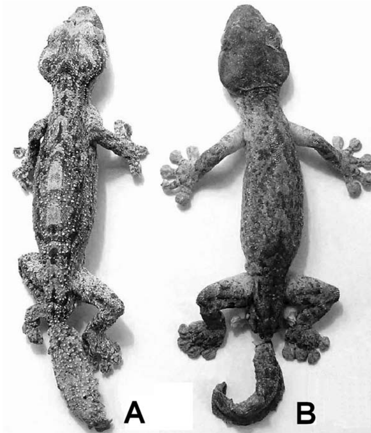
Fig. 2. Dorsal view of two preserved specimens of Uroplatus alluaudi . (A) the new individual from Besariaka (MRSN R1630), (B) ZSM 275/2004 from Montagne d'Ambre.

were measured by the senior author with a hand calliper (precision: 0.1 mm) for standard lengths: snout-vent length (from the tip of the snout to the cloaca); tail length (from the cloaca to the tip of the tail); maximum tail width; head length from the tip of the snout to the jaw articulation; maximum head width; eye diameter, from the snout the nostril, and nostril-eye (Table 1).