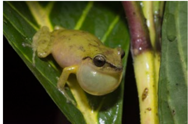
Fig. 1. Male Pristimantis subsigillatus calling.

Individuals were identified as P. subsigillatus based on the characters described by Lynch and Duellman (1997),