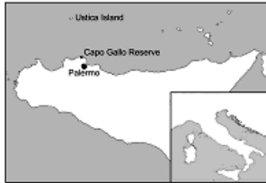
Fig. 1. Study area.

at 100 m a.s.l., is a concrete basin built in the depression of a natural temporary pond. It fills up partially to reach a maximum surface area of about 100 m 2 and a maximum depth of 60 cm. The landscape surrounding the water bodies consists of cultivations and grassland. The two ponds are about 3 km apart.