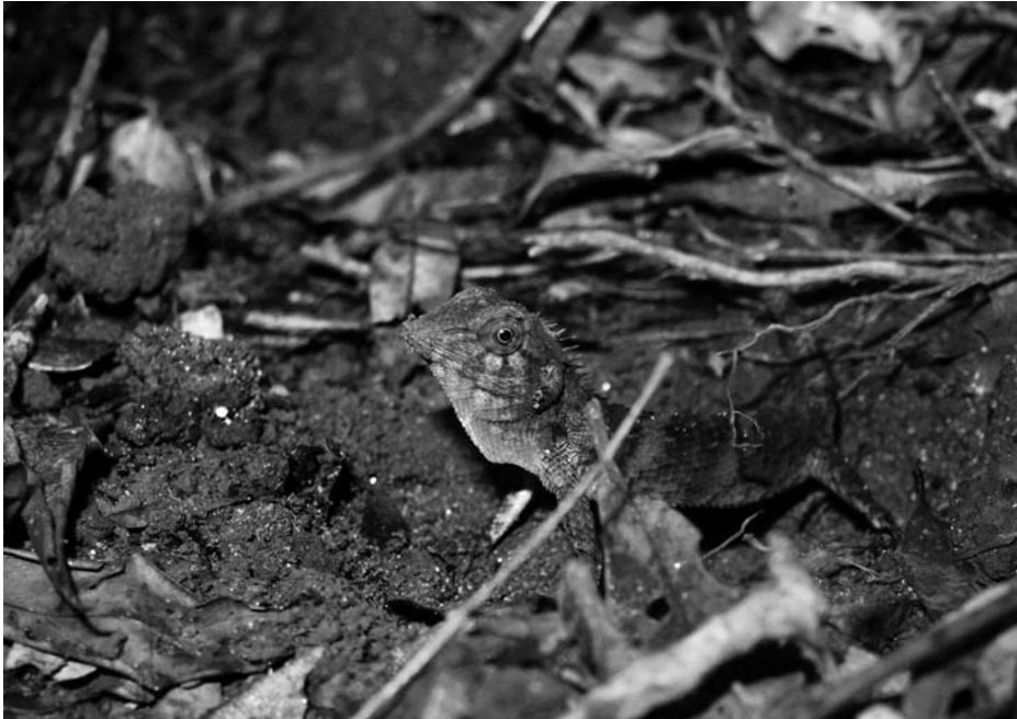
Fig. 1. During the disturbances it expanded its gular sac and looked around.