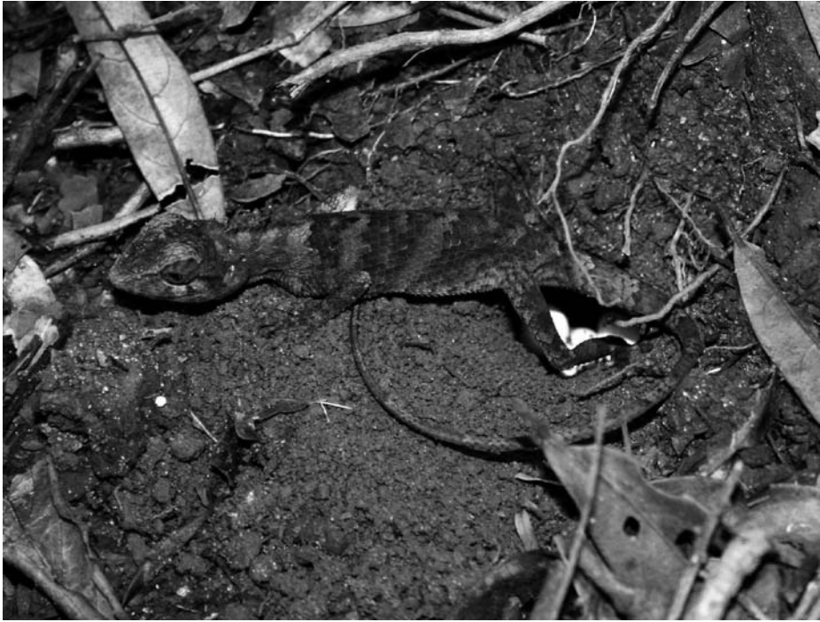
Fig. 2. The lizard laying eggs and see tail is curved.