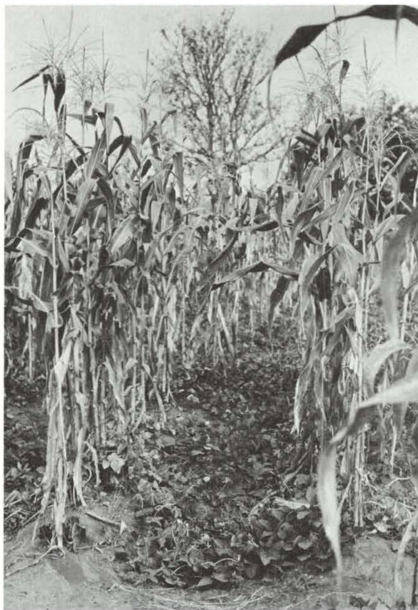
Farmer's field near Ibadan, Nigeria, showing intercrop of cowpea under maize