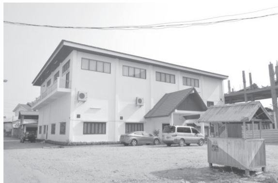
Figures 1 and 2 Teaching and Learning buildings.