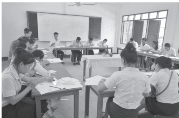
Figures 3 and 4 Painting and Drawing classrooms.