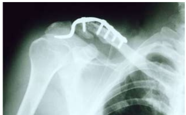
Figure 2. A postoperative radiograph presenting the distal clavicle which was fixed by using a 6-hole hook plate with 4 screws in the medial part and a single screw in the lateral part.

No intra-operative complications have been observed and the patient was instructed to perform pendulum exercises with limit shoulder movements. Four months after surgery, he had pain free during shoulder movements. Union of the distal end of clavicle fracture was revealed by radiographs. He then lost to follow up from orthopaedics department.