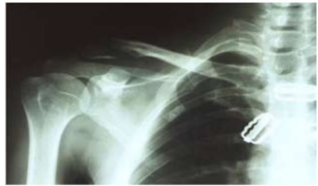
Figure 1. A radiograph showing a distal clavicular fracture (Neer type II).

He was operated by open reduction and internal fixation using 6-hole hook plate with 4 screws into the medial fragment and a single screw into the lateral fragment (Figure 2).