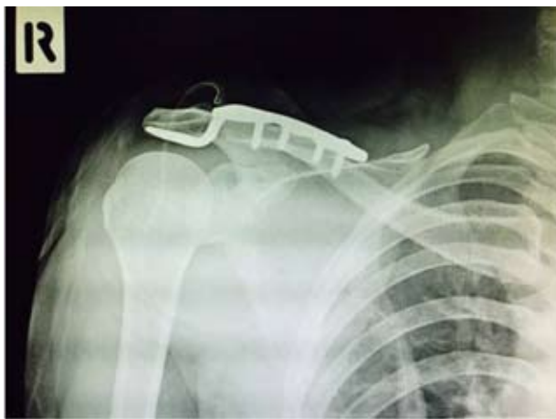
Figure 8. A postoperative radiograph demonstrating a reduction at acromioclavicular joint using a 5-hole hook plate.

She was operated by open reduction together with internal fixation using 5-hole hook plate with 4 screws into the clavicle (Figure 8).