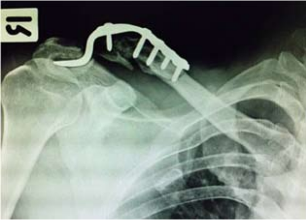
Figure 3. A radiograph showing the clavicle fracture at medial end of the hook plate after the motorcycle accident. Note osteolysis under the acromial surface.

The fracture reduction at distal clavicle was maintained. However, the fracture at medial end of plate was treated conservatively by immobilization in arm sling until no pain during shoulder motions. He, then, lost to follow up again.