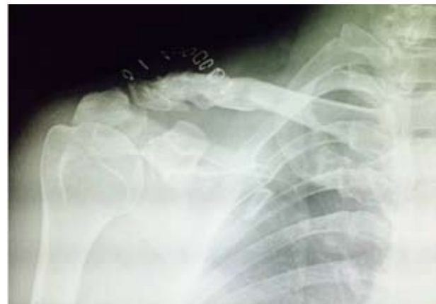
Figure 6. A radiograph after hook plate removal showing the union of both fracture sites (distal clavicle fracture and clavicle fracture at medial end of the hook plate).

After the hook plate was removed (Figure 6), he had a full range of painless shoulder movements.