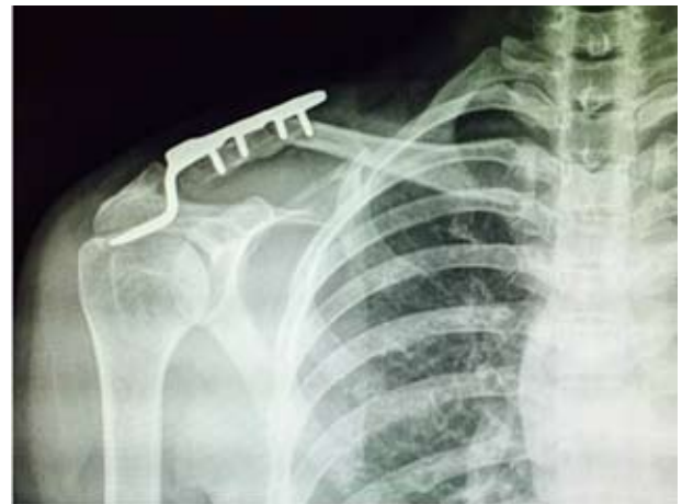
Figure 9. A radiograph revealing the clavicle fracture at medial end of the hook plate after injury.

Two weeks after operation, she experienced pain at right clavicle after lying down on right shoulder. The radiograph showed a fracture at the medial end of plate (Figure 9).