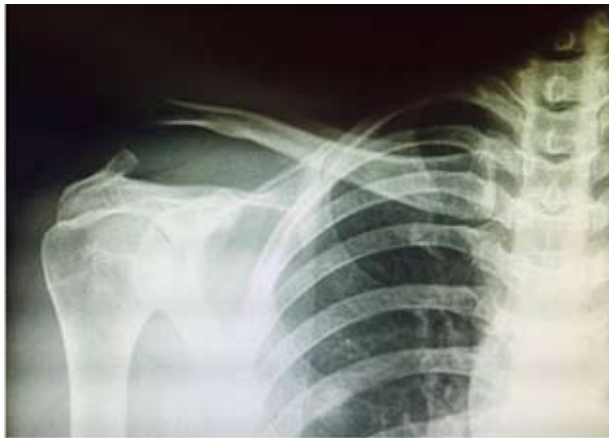
Figure 7. A radiograph showing acromioclavicular joint dislocation (Rockwood type IV).

In February 2015, a 47-year-old woman fell motorcycle and landed heavily on her right shoulder and arm. She had painful and could not move her right shoulder due to displaced right acromioclavicular joint (Rockwood type IV) (Figure 7) with no associated neurovascular deficit.