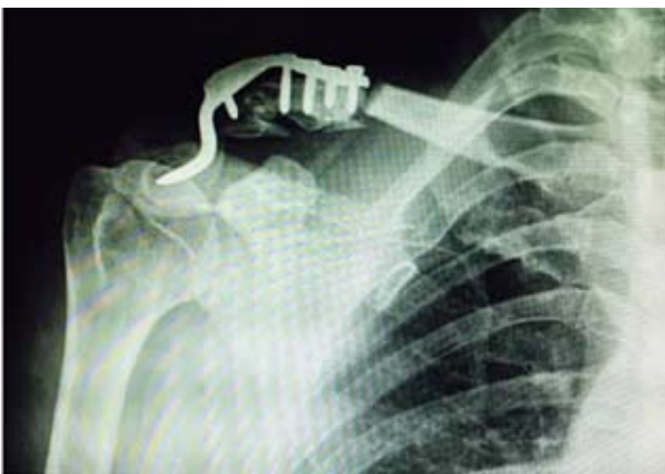
Figure 4. A radiograph demonstrating the clavicle fracture at medial end of the hook plate after the second injury.

A year after his second injury, he came to the orthopedic department due to medium velocity traffic accident. He presented with painful at right clavicle. The radiograph showed a fracture at the medial end of plate (Figure 4).