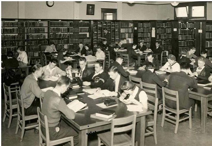
Seattle Pacific College Library, circa 1940

This year is the 125th Anniversary of the founding of Seattle Pacific University and its library. The Library began as a modest vision in the Articles of Incorporation from June 1891: There would be a reading room with books on hygiene, missions, and other resources necessary for the school. On December 1, 1891, the Seattle Public Library began to realize its own vision by providing access to some 6,000 books in rented rooms in a Pioneer Square hotel. Although founders expected these libraries to grow over time, no one in the 1890s imagined how radically library collections, services, and spaces would evolve throughout the coming century. Even H.G. Wells, whose time-traveling protagonist journeys thousands of years into the future, did not imagine a library becoming much more than books in a building.