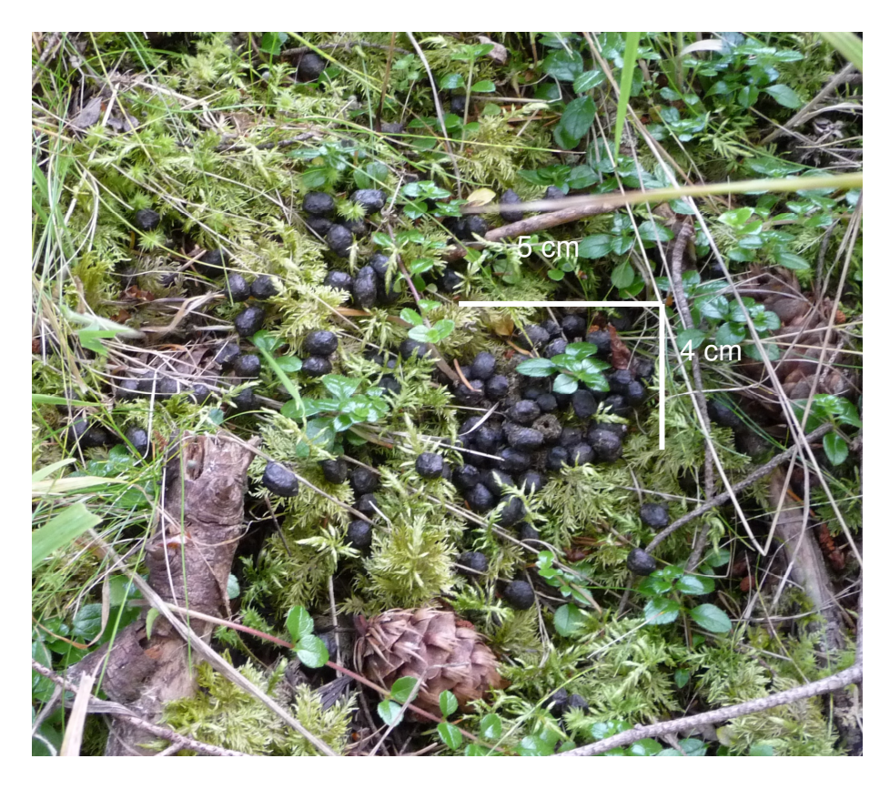
Figure 2. One pellet group defined as 18 or more pellets within 20 \text{ cm}^2 and within 1 m of the transect line (Campbell et al. 2004).