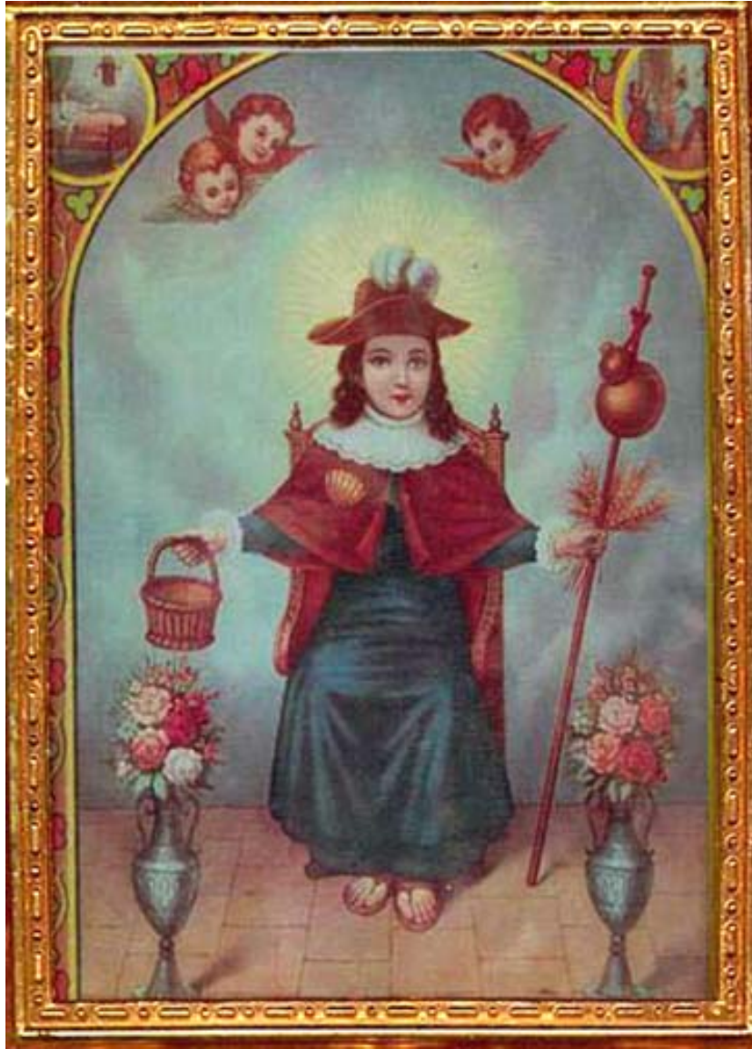
Fig. 6: “El Santo Niño de Atocha,” oil on canvas, ca. 19 th Cent., johntoddjr.com ,

http://www.johntoddjr.com/36%20Atocha/atpr.htm (accessed May 21, 2014).