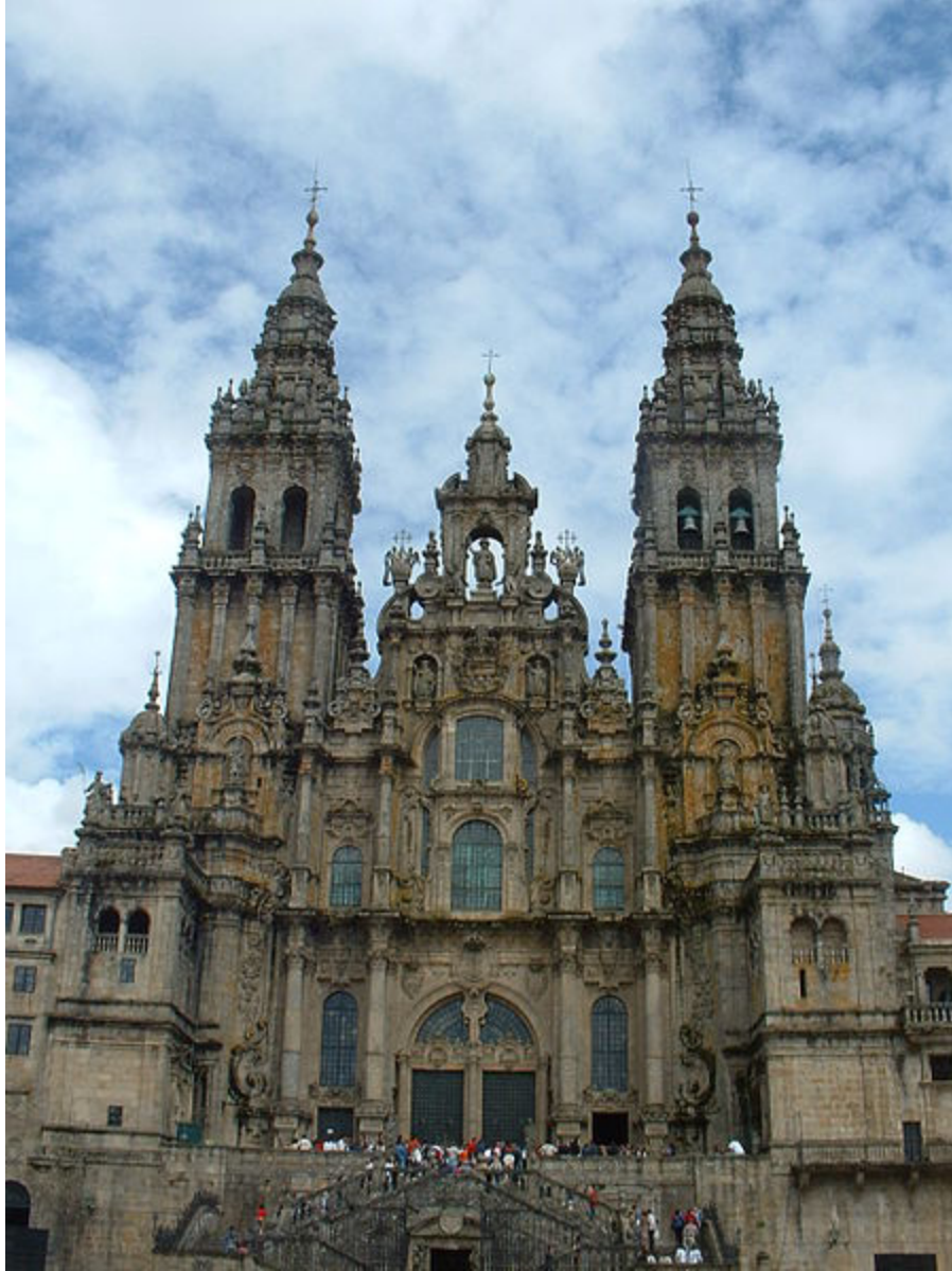
Fig. 1: Vasco Roxo, “Church of Santiago, Santiago de Compostela, Galicia, Spain,” photograph, 2005, wikipedia.com , http://en.wikipedia.org/wiki/Santiago_de_Compostela_Cathedral (accessed