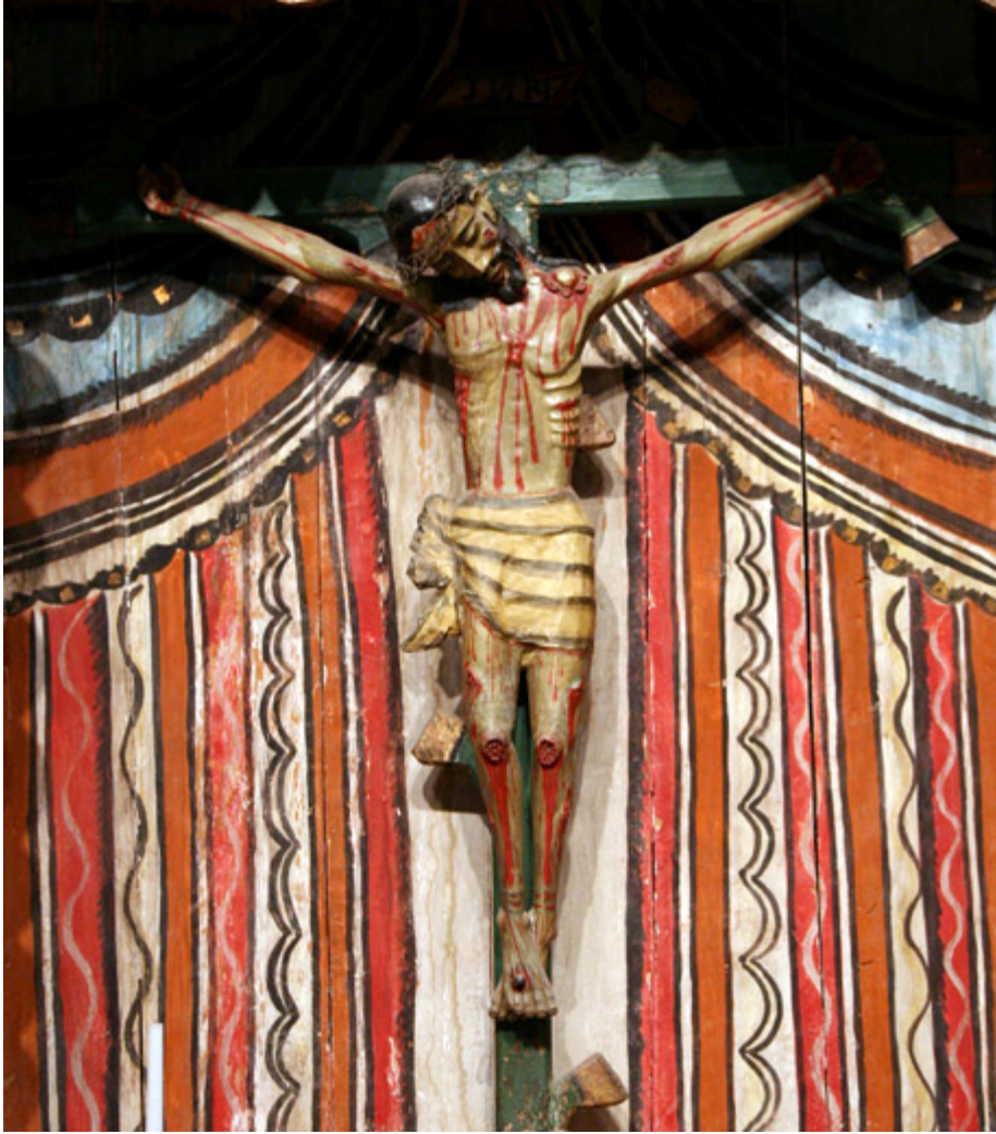
Fig. 5: “Nuestro Señor de Esquípuas,” photograph, 2010, elsantuariodechimayo.us , http://www.elsantuariodechimayo.us/Pilgrim/CloseupPages/SantuarioSenorEsquipulas.html