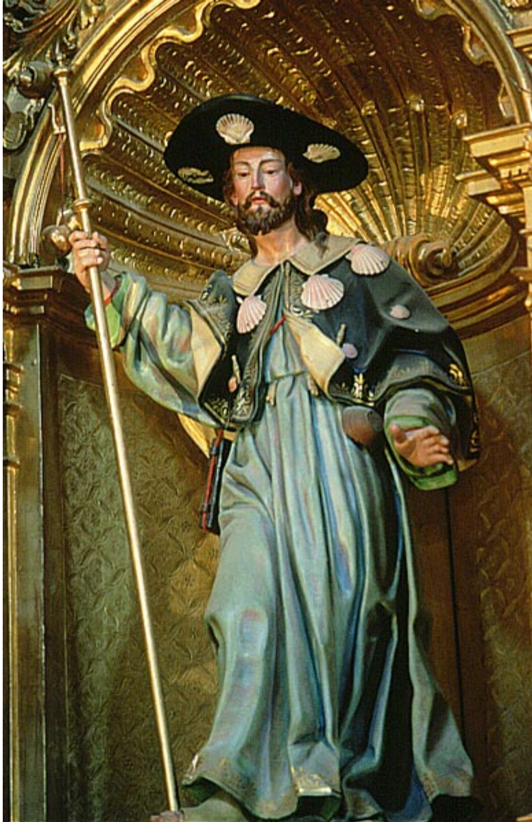
Fig. 2: Joaquín Guijarro, “Colegiata de Nuestra Señora del Manzano. Santiago peregrino,”

photograph, ca. 2014, Centro Virtual Cervantes ,