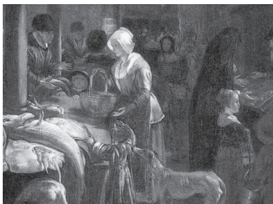
The Old Fish Market on the Dam, Amsterdam (circa 1650)