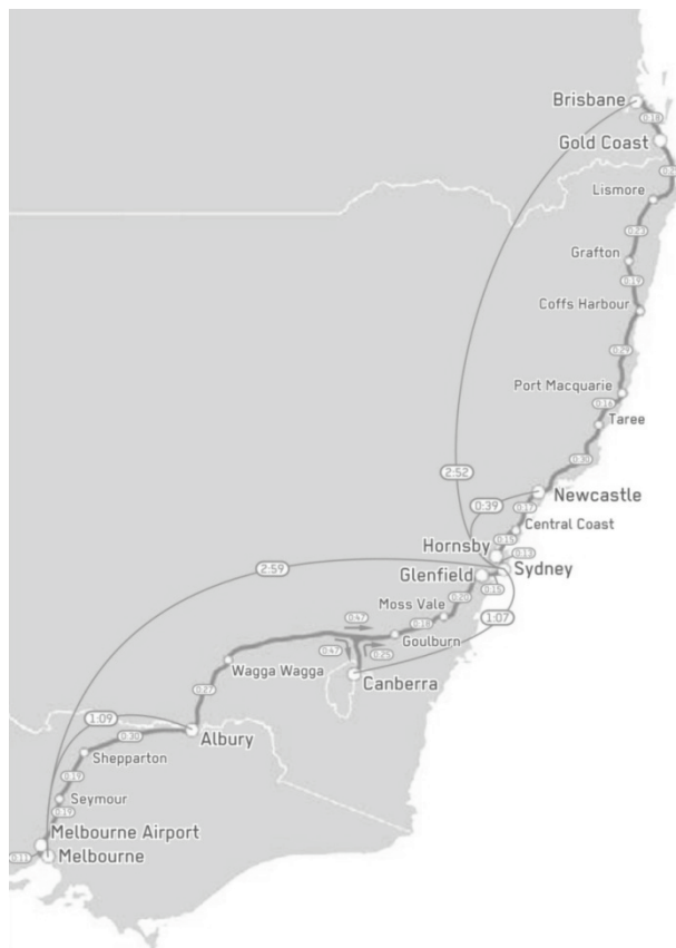
Fig. 4. The HSR route suggested in the Zero Carbon Australia High Speed Rail document, along with the planned journey time.

instead of 1,748 km (Fig. 4). At the same time the length of tunnels was decreased by 44%, and bridges by 25%, assuming greater use of the existing transport corridors. The document criticized not only the 45-year construction schedule, but also the cost of the complete transport corridor planned in stage 2. According to the forecasts of BZE the investment can be completed within 10 years (the completion is planned for 2025) with the financial expense of $84.3 billion. To confirm the possibility of realizing the investment in an apparently ambitious time of 11 years, the foreign railway projects are mentioned. Only the financial aspect of the investment remains the barrier.