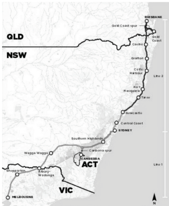
Fig. 3 Planned railways for high speed trains – stage 2. Source: Department of Infrastructure and Regional Development; www.infrastructure.gov.au/rail/trains/high_speed ; Chapter 6: Staged delivery (12.03.2015).

The simulations that were carried out confirm substantial savings in journey times as compared to journeys by other means of transport. The comparison of journey times for different means of transport for selected routes is presented in Table 2.