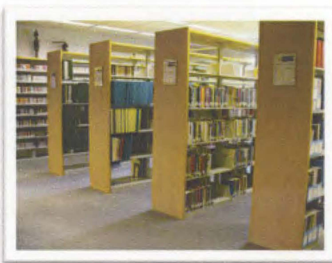
Note the empty shelf space. Summer 2008.

In the age of digital information, librarians constantly ask, "What is a library?" My personal view of a library is a place—a room—in a 19th century mansion where a butler tells arriving guests to await their host. The library in these old private mansions typically had a collection that was practical and useful to its residents. Therefore, being practical and useful became guiding concepts in the development of a music library.