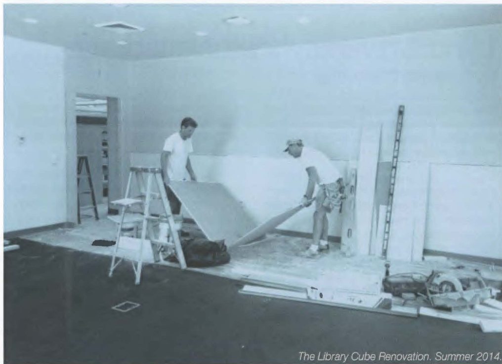
The Library Cube Renovation. Summer 2014.