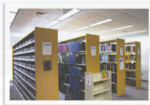
Music Library Fall 2015.

The Music Library at Lynn University currently holds 1,600 books, 6,400 scores, 4,000 CDs, and 448 DVDs. I may have conceived it, but it has expansively grown because of the collaboration between music students and their faculty.