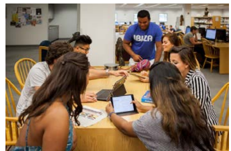
iBooks Catalog Expanding