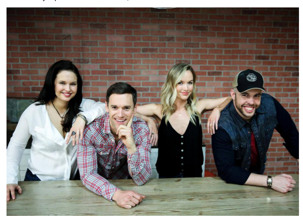
Above: 7th Ave. has brought together various elements of production and artistry to connect with their audiences across the nation.

For additional information on the band, visit 7thaveband.com. Students, faculty and staff can purchase discounted tickets for $25 by visiting thewick.org or by calling (561) 995-2333.