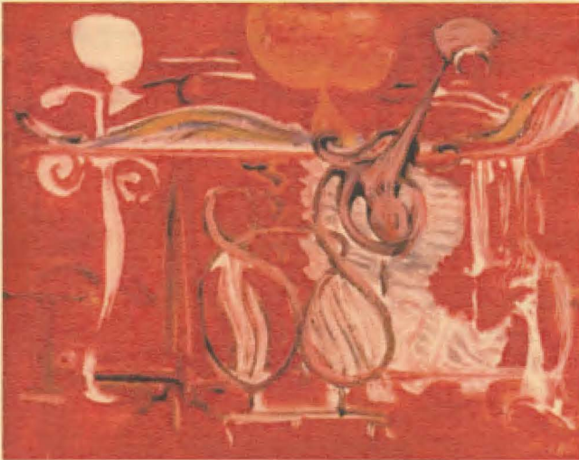
Red Abstract, Mark Rothko

When talent meets inspiration, the results are extraordinary.