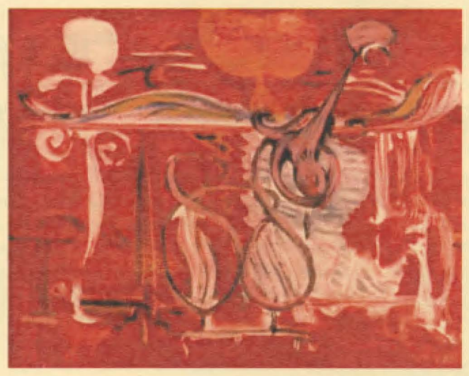
Red Abstract, Mark Rothko

When talent meets inspiration, the results are extraordinary.