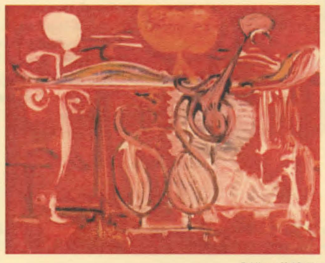
Red Abstract, Mark Rothko

When talent meets inspiration, the results are extraordinary.