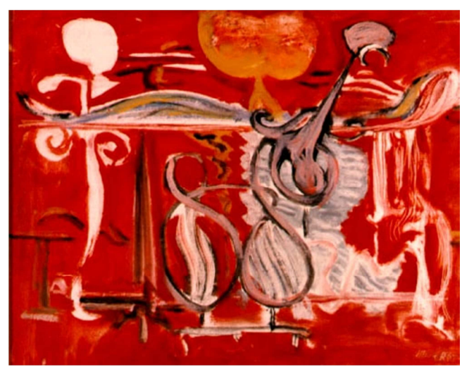
Red Abstract, Mark Rothko

When talent meets inspiration, the results are extraordinary.