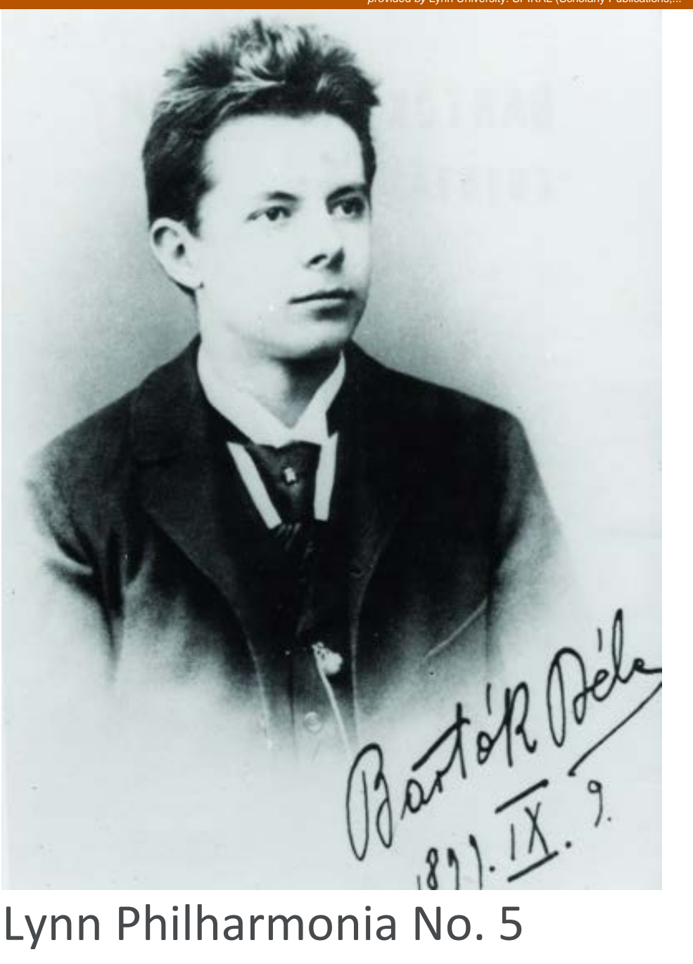
Lynn Philharmonia No. 5