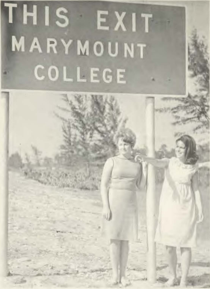
The sign led to Marymount