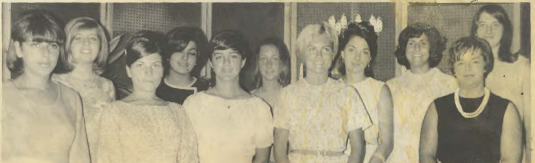
Students are initiated into Phi Theta Kappa honor society.

There's something about Marymount college where the lantern of truth is held high where we're taught to hold dear the ideals of our years Marymount, we'll love you. . . evermore.