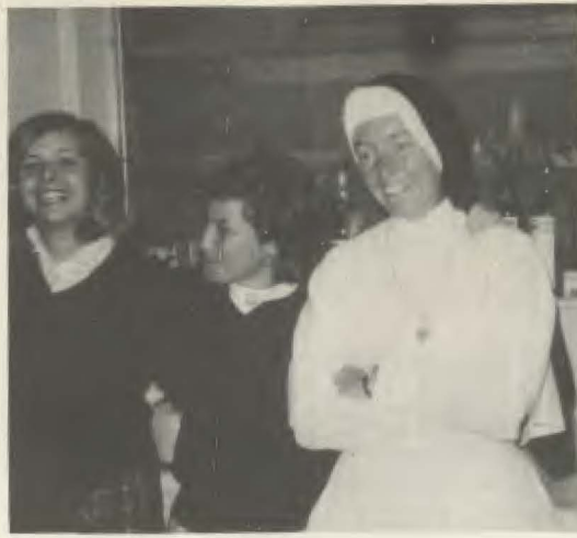
The news had just been told