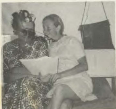
Although it was hard to concentrate