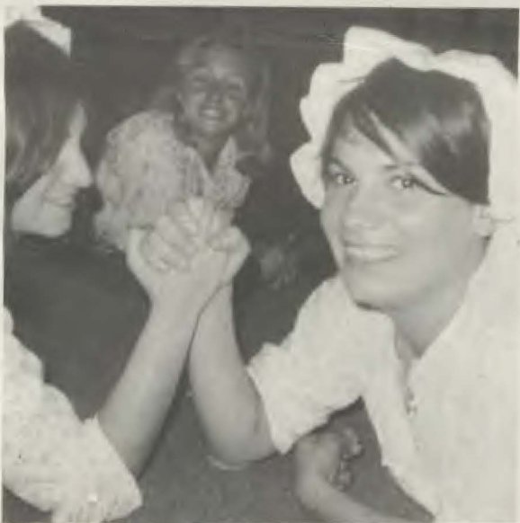
We fought over who would be in first