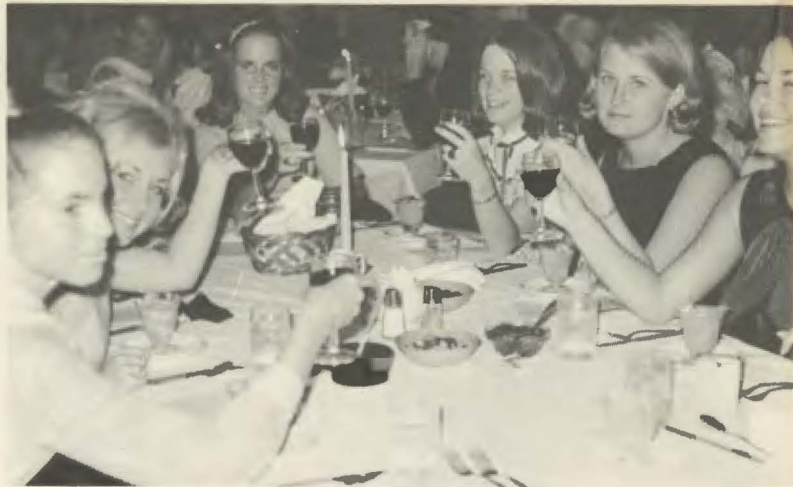
A toast to a speedy recovery