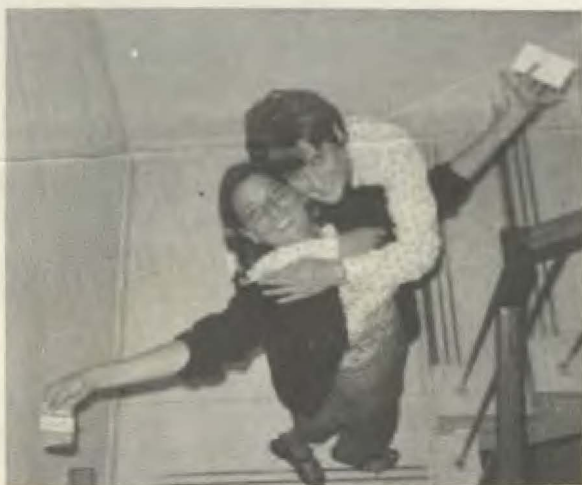
There was a lot of pride