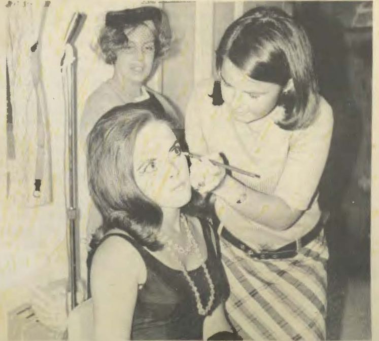
"You're on in five. . . ." Florence Unlimited proves successful.

Membership to this society is one of the highest honors on campus. The new and old members deserve to be congratulated for their achievements.