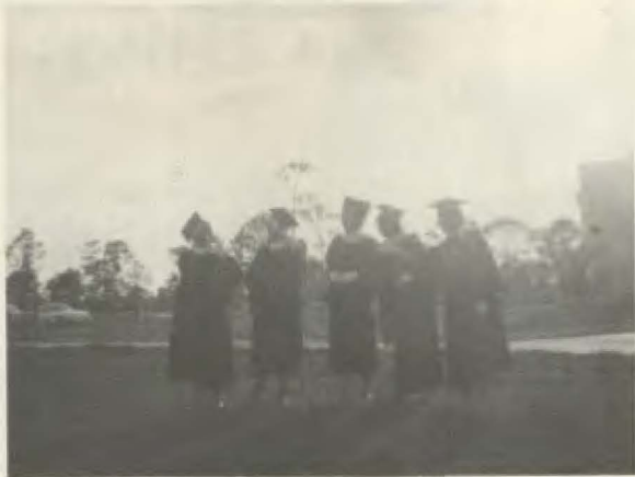
Finally at the end