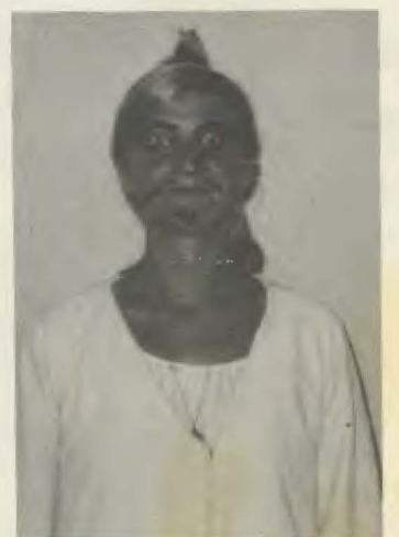
Our insanity was a true downfall