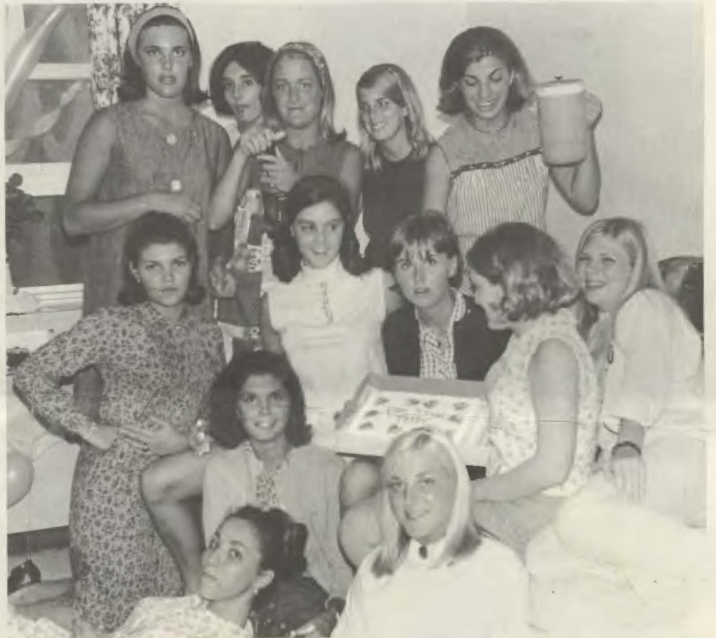
We tried to celebrate the occasion