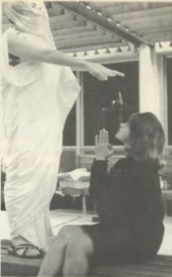
A mythological approach was added