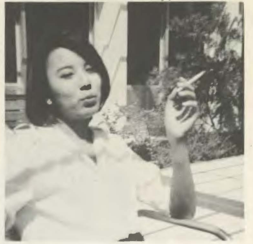
Who would argue the facts?