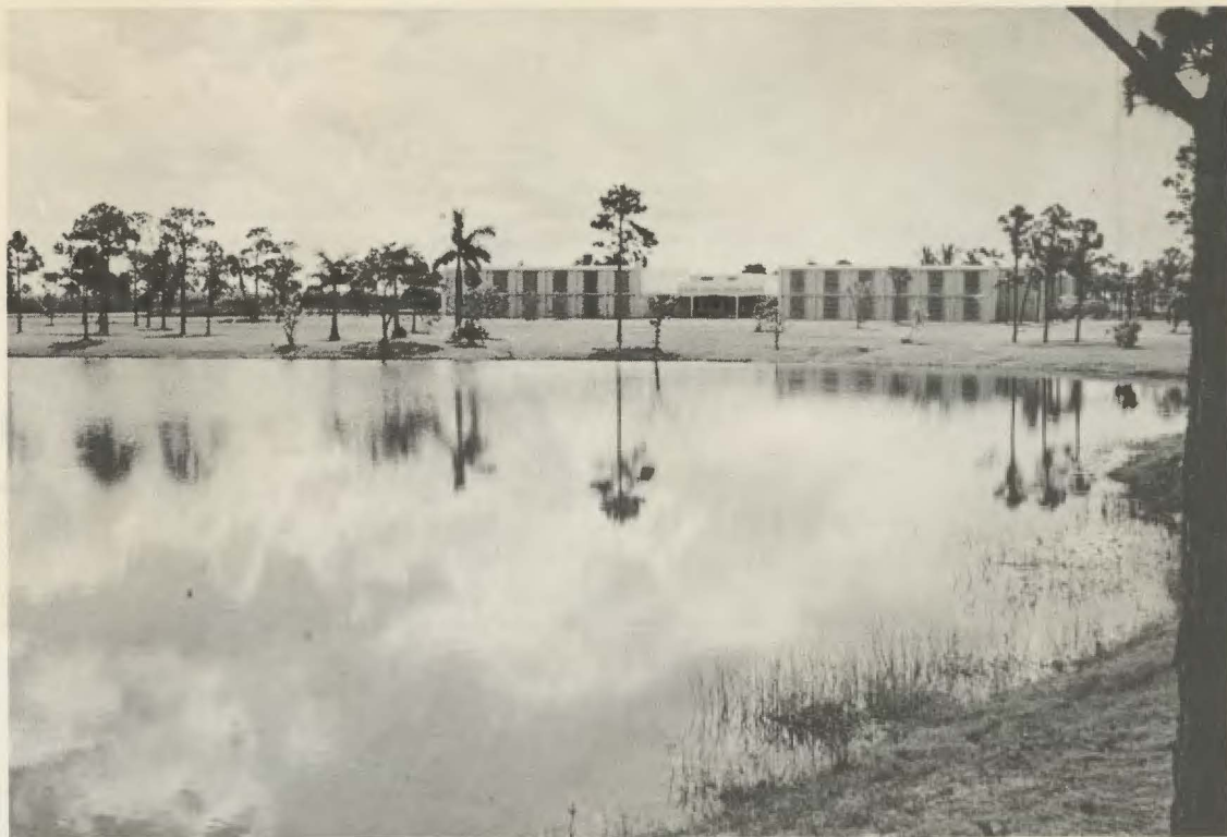
Pleasant days reflected at Marymount