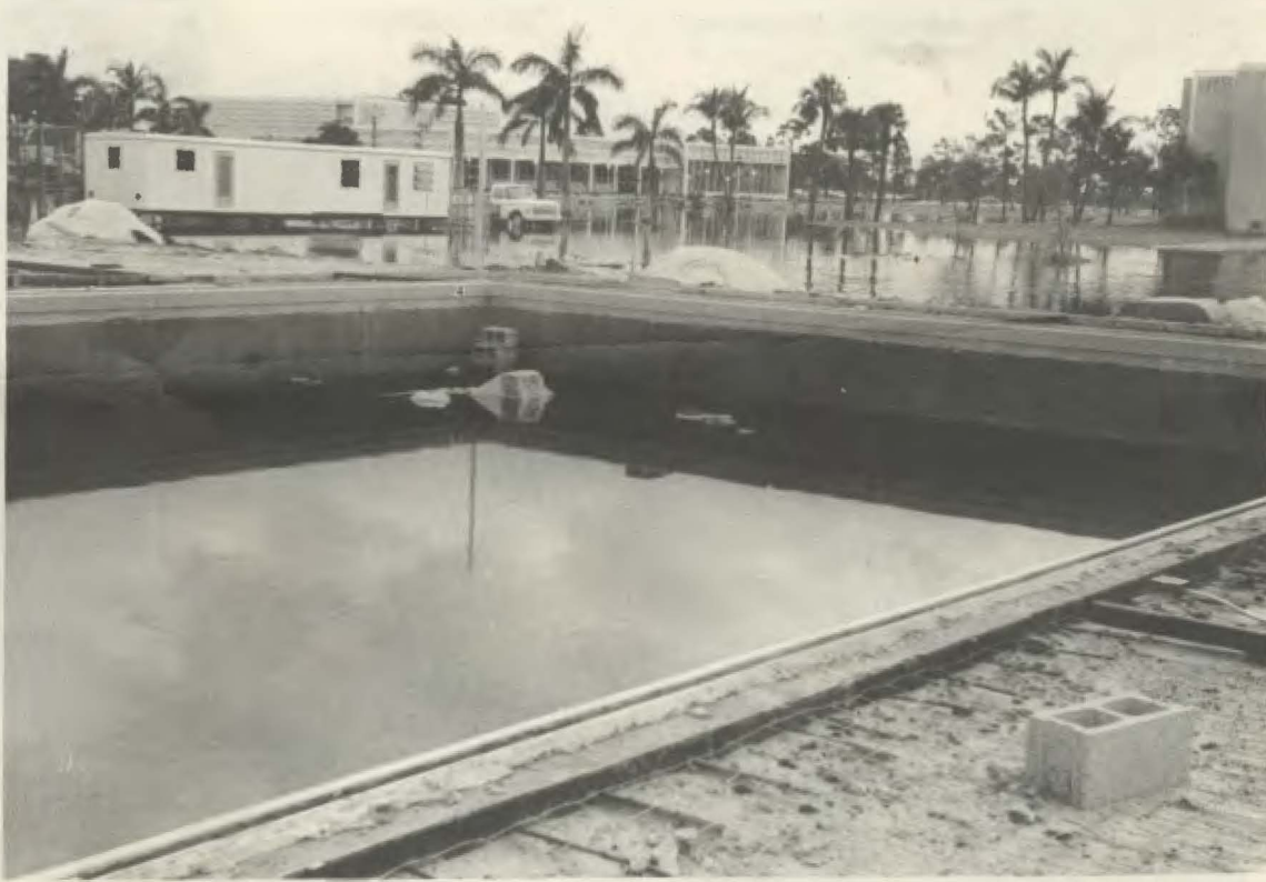
The pool! - One great night it happened