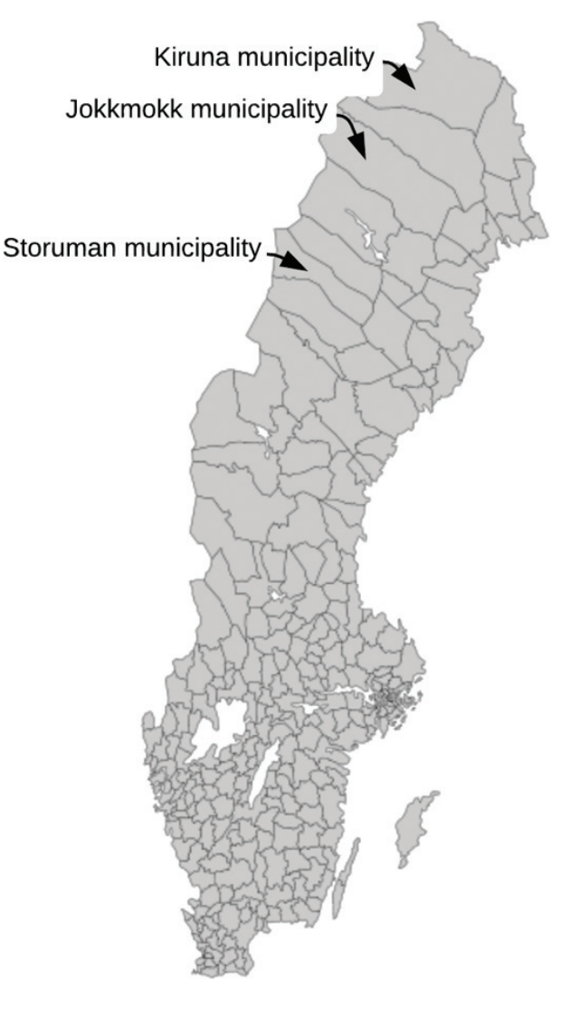
Figure 1. Map of Sweden

actors.<sup>37</sup> The legal possibilities for local actors, including the municipality, to influence the decision-making process is thereby strictly limited.