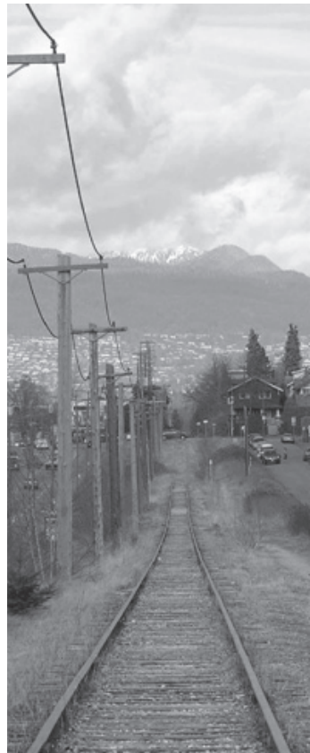
Figure 4. The Arbutus Corridor, looking north towards 16th Ave., shortly after the SCC decision in February 2006.

Discussions between the City and the CPR over the corridor have occurred sporadically since the SCC decision, but without any sense of urgency, at least not from the City. 94 The last visioning process, commissioned by the CPR but conducted independently by an eminent panel of academics, planners, and others, recommended in 2007 that the corridor and adjacent city streets should be used “to accommodate a continuous greenway and possible future transportation route with carefully considered opportunities for development in select locations.” 95 The panel imagined that residential and commercial development along portions of the corridor would generate the funds for the City to acquire the land and build the recommended public infrastructure. Moreover, this development could fit with the city’s “EcoDensity Initiative” to add affordable housing in ways that reduced the ecological footprint of the city’s residents. 96 The panel also suggested that the development could be a showcase for sustainable urban infill development when attention turned to Vancouver for the 2010 Winter Olympics. However, perhaps because of that event and the City’s preoccupation with its development of an athlete’s village