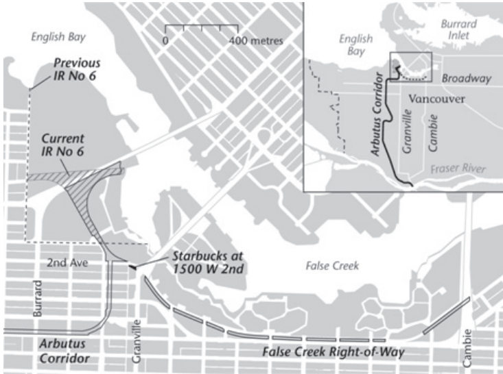
Figure 3. False Creek Right-of-Way. (In 1996, the City acquired the False Creek Right-of-Way between the Arbutus Corridor and Cambie Street from the CPR after the company sold a small segment to a developer who built a coffee shop and leased it to Starbucks, severing the right-of-way from the Arbutus Corridor. In 2002, the British Columbia Court of Appeal ruled that ten acres of CPR land, which had been Indian Reserve, should be reserve again. This decision removed the northern-most portion of the Arbutus Corridor — the crescent-shaped portion that was part of the Indian reserve — from the city’s jurisdiction.)

Such was the urban, corporate, and political context from which the dispute over the Arbutus Corridor emerged. By the end of the 1970s it was clear that False Creek’s industrial era was ending. The federal government and the City had re-made Granville Island as a public market and much of the inlet’s south shore as a moderate-density residential neighbourhood with a mix of parks, townhouses, and apartments. The province had acquired most of the CPR’s railway lands on the north shore for a world exposition, then for massive residential development. The transformation of False Creek from an industrial zone to a dense, residential neighbourhood has been hailed as a model of inner-city redevelopment, 41 but it also sealed the fate of the Arbutus Corridor as a viable freight line. Without industrial customers, the CPR began looking at other uses for its forty-five acre corridor. Under the auspices of Marathon Realty, the CPR had become a land developer. Although its False Creek lands were developed by another firm, the company was working on other large development projects and the Arbutus Corridor presented such an opportunity. 42 Finally, it was clear that the City was actively seek-