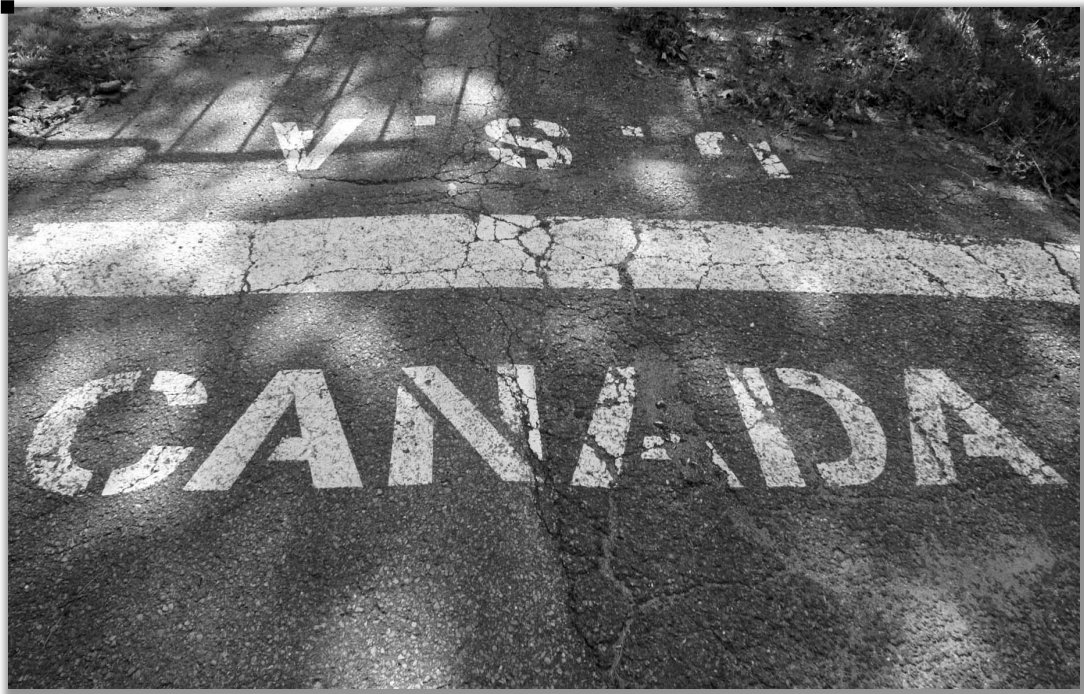
The Canada-U.S. border dividing Stanstead, Québec and Derby Line, Vermont, July 2012.

The Multiple Borders Strategy and Safe Third Country Agreement undermine Canada's proud history of refugee protection, as well its global leadership in asylum matters. By implementing and intensifying these measures, Canada sets a poor example for other countries, and contributes to the deterioration of refugee protection around the world.