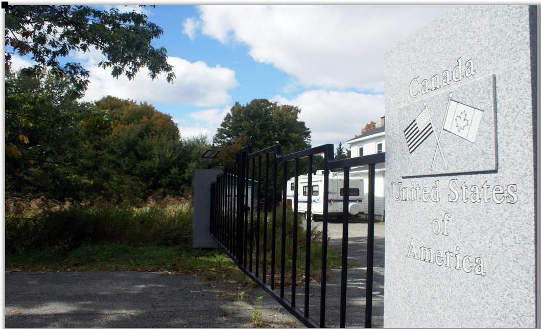
The Canada-U.S. border dividing Stanstead, Québec and Derby Line, Vermont. July 2012.

Part Five concludes that the Multiple Borders Strategy and the Safe Third Country Agreement systematically close Canada's borders to asylum seekers, contravene Canada's refugee protection obligations under domestic and international law, make the Canada-U.S. border more dangerous and disorderly, and undermine Canada's proud history of refugee protection.