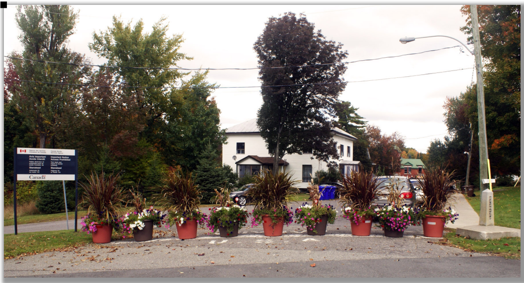
The Canada-U.S. border dividing Stanstead Québec and Derby Line, Vermont, lined with flowers. Sept 2012.