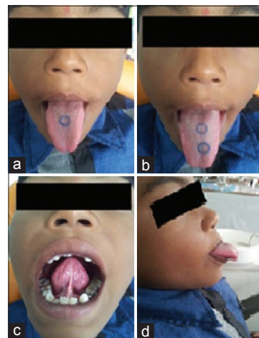
Figure 2: (a) One elastic swallow tongue exercise (b) Two elastic swallow tongue exercise, (c) Hold pull tongue exercise (d) Tongue extension/protrusion exercise

“Hold pull exercise” is a tongue exercise, in which tip of the tongue is made to contact the palate in the midline at the crest of the hard palate. Then the patient is asked to gradually open the mouth without a tongue losing the contact with a palate. This exercise helps in stretching the lingual frenum [Figure 2c].