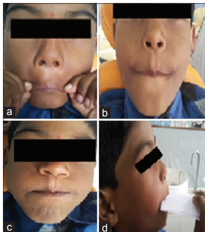
Figure 1: (a) Lip pulling exercise (b) Lip pressing exercise (c) Lip puffing exercise (d) card pulling exercise

Many malocclusions develop as a result of abnormal tongue habits like tongue thrusting or aberrant tongue swallowing