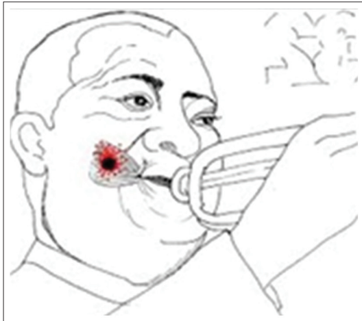
Figure 5: Trumpet blowing exercise