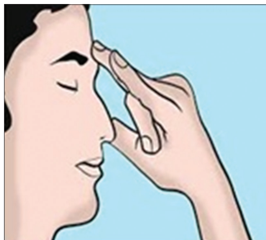
Figure 4: Pranayam breathing exercise

Use of trumpet will help in strengthen the lips and cause the tongue to confine its action within a definite area. The area of lips, which come in contact with a mouthpiece will feel a stimulating effect and fuller flow of blood to the musculature. By continued use of this instrument hypotoned tissue will develop a normal tonicity and short flabby lips will lengthen. During the use of this instrument, the tongue is raised from the floor of the mouth and stimulates the tissue of lower lip and reduces tension in the upper lip [Figure 5].