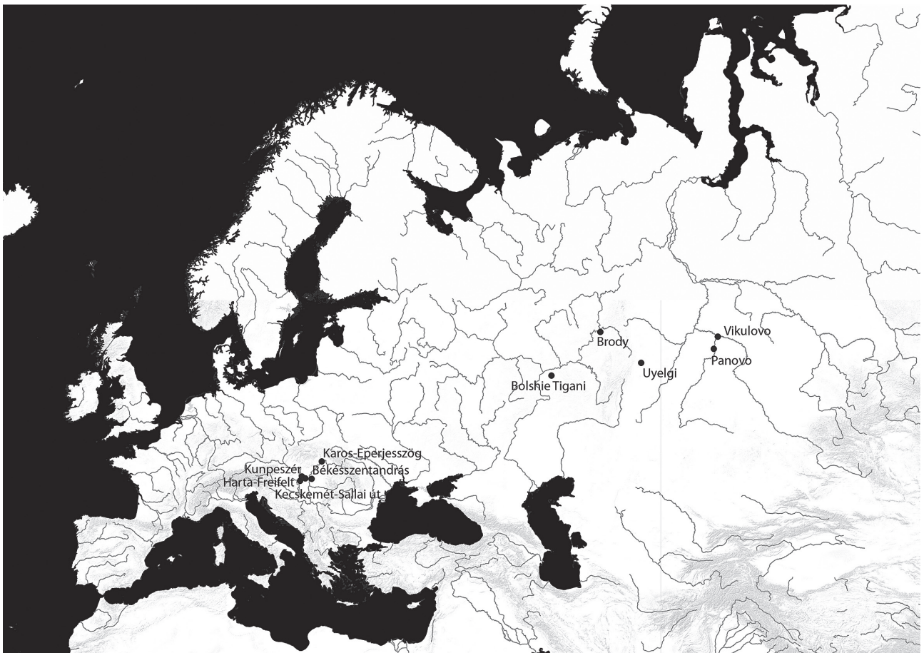
Fig. 1. Location of the discussed cemeteries in the Carpathian Basin and in Ural region Рис. 1. Расположение исследованных могильников в Карпатском бассейне и на Урале

The phylogenetic tree of subhaplogroup Y1a1 (fig. 2b) consist of various North and East-Central Asian lineages, where an Avar period individual from Kecskemét-Sallai út is in basal position compared to the other modern samples from China and Far Eastern Russia. Furthermore, a Hungarian Conqueror from Karos I. is also represented, closest to a modern Uygur Y1a1 lineage. Due to the small number of available Y1a1 lineages along with their defined relative geographical proximity, but considering the fact, that they are separated by many mutation points, only a common geographical origin can be considered for the presented Y1a1 lineages.