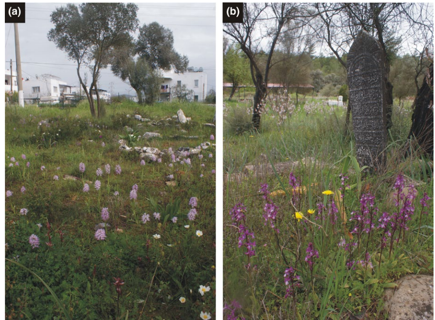
FIGURE 2 Mass occurrences of orchids in Turkish graveyards. (a) graveyard of Kızılağaç village (Muğla) with Orchis italica , (b) graveyard of Uğrar village (Antalya) with Orchis anatolica .