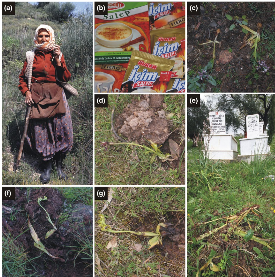
FIGURE 1 (a) Salep harvesting elderly woman near Söke (Aydın) in April 1993; (b) different instant salep products are widely available in Turkish stores; (c) excavated Anacamptis syriaca specimens in the graveyard of Belen village (Antalya Province); (d) excavated flowering Anacamptis papilionacea specimen in the graveyard of Bayır village (Muğla Province); (e) excavated fruiting Himantoglossum robertianum specimens in the graveyard of Kemer village (Muğla Province); (f) excavated juvenile H. robertianum individual and flowering Ophrys lutea subsp. minor specimen in the graveyard of Beşikci village (Antalya Province); (g) excavated Ophrys blithopertha specimen in the graveyard of Bayır (Muğla Province)

at least 28,200 kg of salep was exported annually between 1994 and 1999 (Kasperek & Grimm, 1999). To gain 1 kg of dried salep, approximately 625–4,762 specimens (mean \pm SD = 2,599 \pm 1,710) are destructively harvested (Sezik, 2002b). The number of orchid individuals collected annually in Turkey is estimated at 10–20 million by Kasperek and Grimm (1999), 30 million by Özhatay (2002), and 40 million by Sezik (2002a) Sezik (2002b).