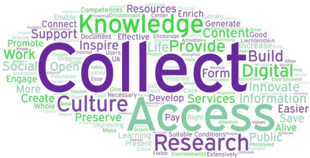
Fig. 1. Words most frequently found in European national libraries' strategic plans

The words carrying the greatest weight were: collect (9), access (6), knowledge (6), research (5), culture (5), provide (5), information (5), digital (4), support (4), innovate (4) and content (4). The word cloud constituted the literal expression of each strategic objective. Consequently, the next stage of the analysis consisted in defining 11 subject categories with which European national libraries' priority lines of action for the years to come were aligned (Figure 2). Those categories were established by merging several of the expressions used in the plans for reader comprehensibility and study.