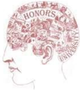
Figure 2: Honors Program Logo (“SUU Honors Program”)

In addition to the motto, the Honors Program attempts to gain a collective grouping through the development of a branding or logo; unfortunately, the logo does not have the same effect as the motto. Southern Utah University’s Honors Program developed a logo featuring a human head from the neck upward. Within Figure 2, the logo depicts many different thoughts, with the word “honors” presented clearly in the center. Even though this logo is extremely stimulating to the eye, the picture’s busyness sets the viewer on edge, making it not the ideal choice in a logo. The lack of visual pleasantries results in members failing to identify with the logo, causing a rift between the program and individuals. Through utilizing a more simplistic and classy logo, the honors program would find more fluidity between the motto and their logo, allowing for a stronger picture of the SUU honors student.