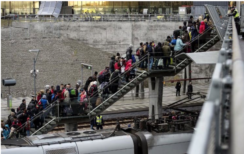
Asylum seekers line up at a train station in Malmö, Sweden, where others will be coming from Denmark, November 19, 2015. Many refugees in Denmark have been victims of torture.