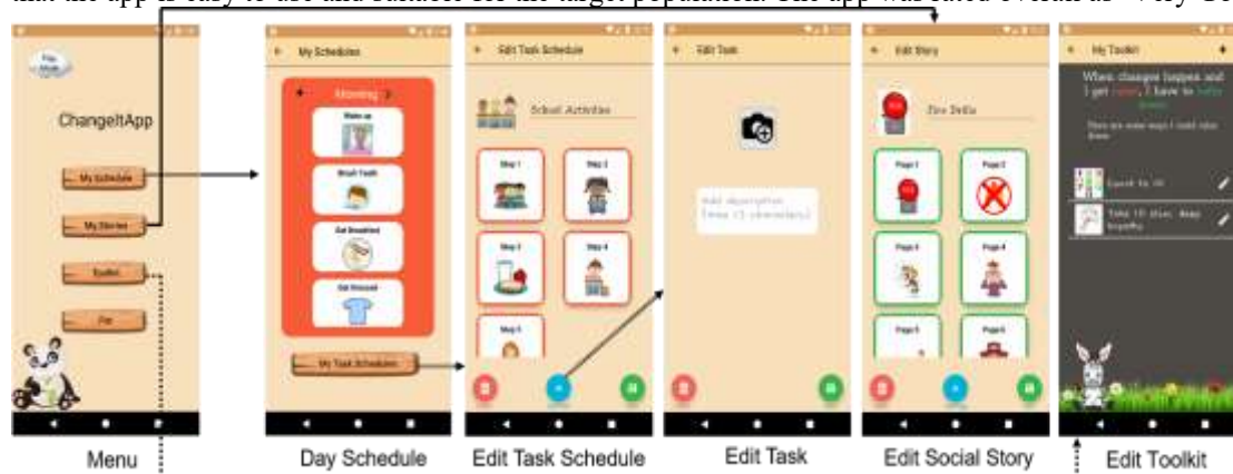
Figure 3. The practitioner interface to the ChangeIt app

Descriptive Statistics and Thematic Analysis (Braun & Clarke, 2006). The majority of the participants agreed that the app is easy to use and suitable for the target population. The app was rated overall as ‘Very Good’