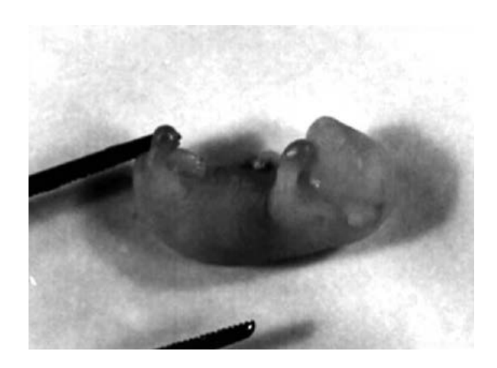
Figure 1. Anomalies in the formation of fetal extremities in the embryo administered with lamotrigine at 25 mg/kg.

Table 1 , there was a significant difference in terms of height and weight among the four study groups. In group 2, a decrease in weight and height after administrating ethanol as a LTG solvent was seen compared to group 1.