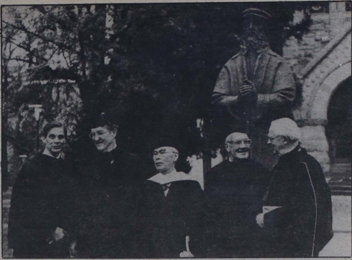
Ursinus dignitaries gather at Founders' Day.

The WRUC staff takes time from their busy schedule to pose for a photo.