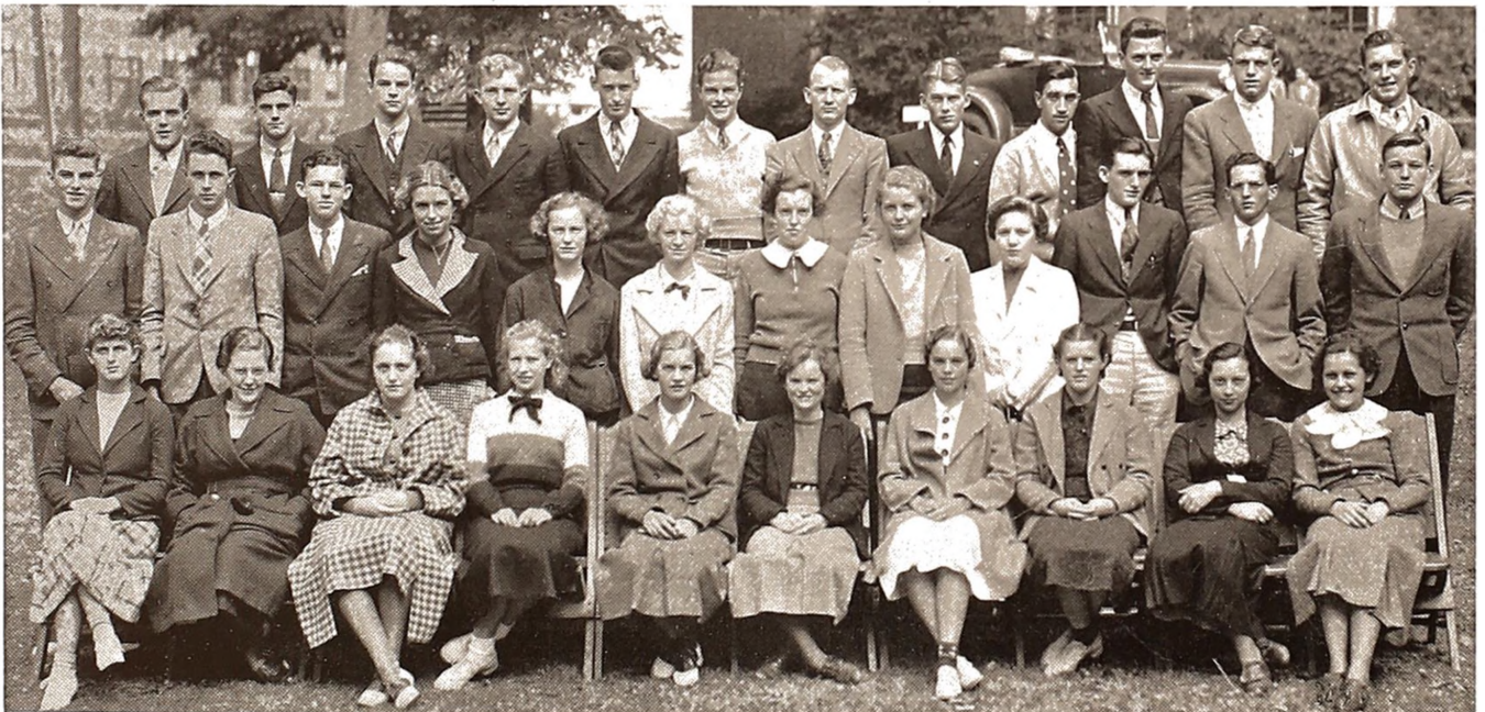
ALUMNI SONS AND DAUGHTERS, CLASS OF 1939